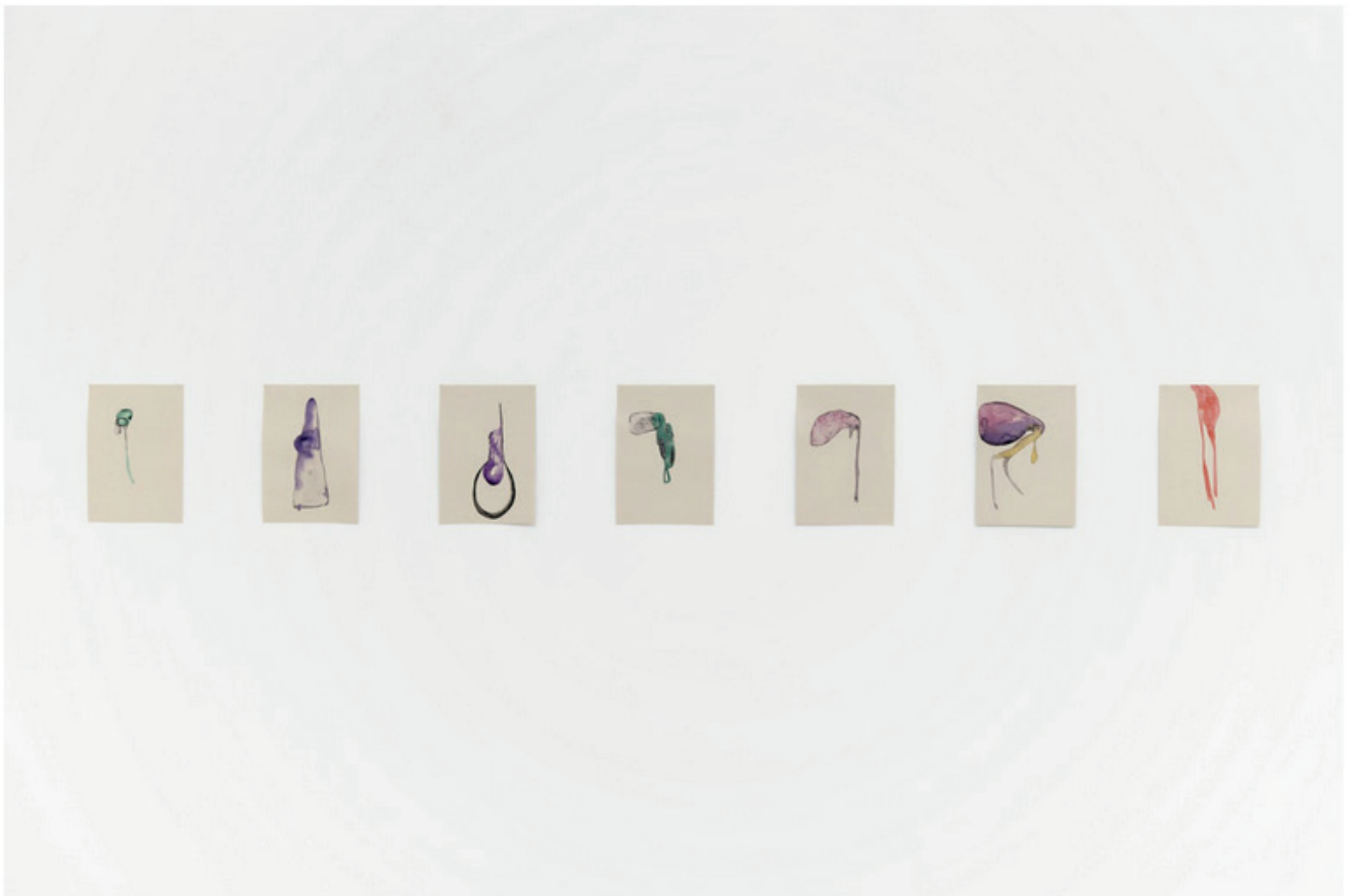
Michele Ciacciofera, Condenser l'Infini , 2024, exhibition view, Passerelle Centre d'art contemporain, Brest