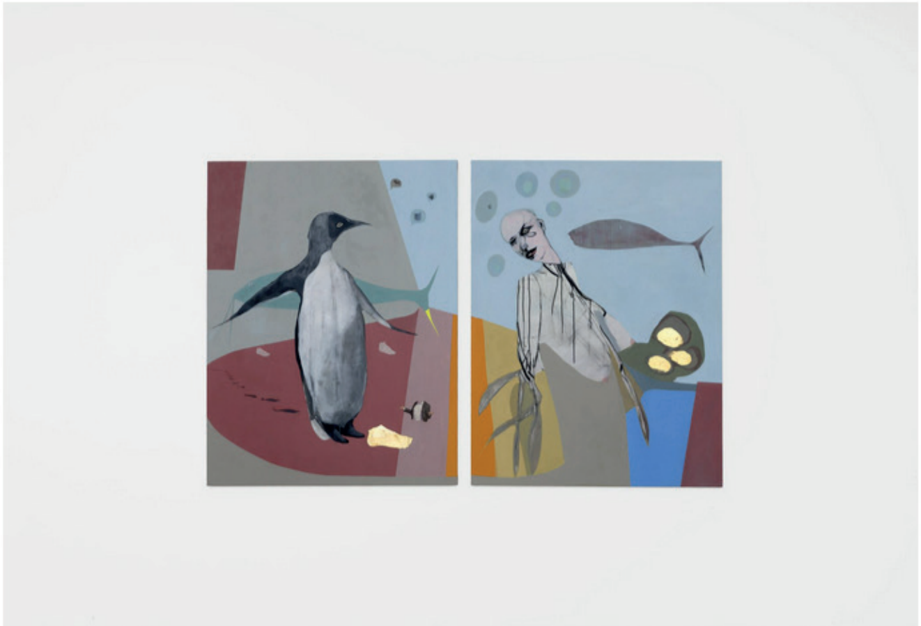
Michele Ciacciofera, Condenser l'Infini , 2024, exhibition view, Passerelle Centre d'art contemporain, Brest