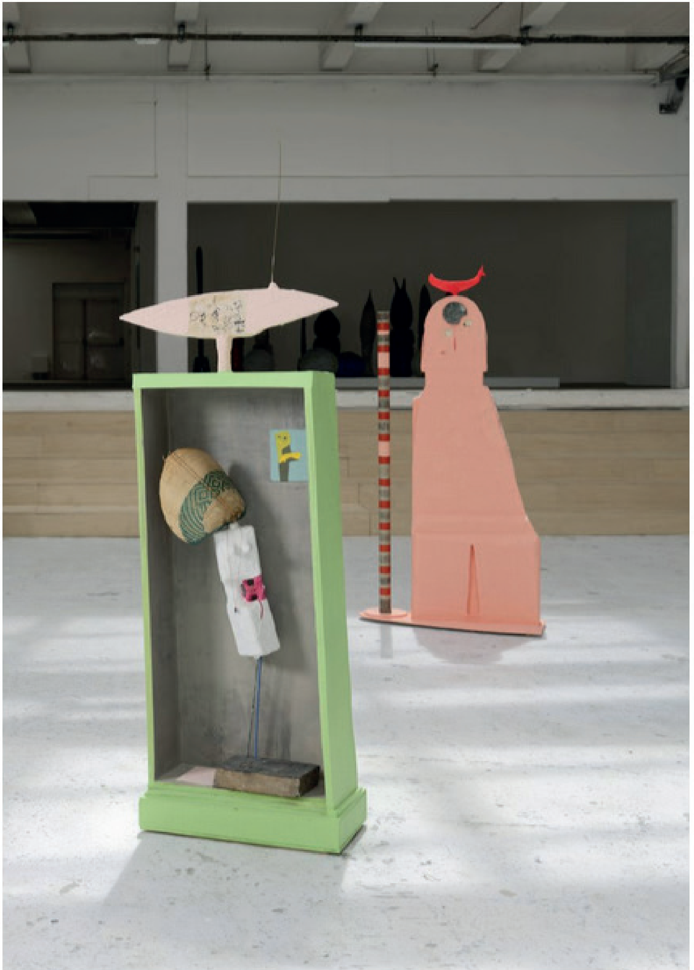
Michele Ciacciofera, Condenser l'Infini , 2024, exhibition view, Passerelle Centre d'art contemporain, Brest