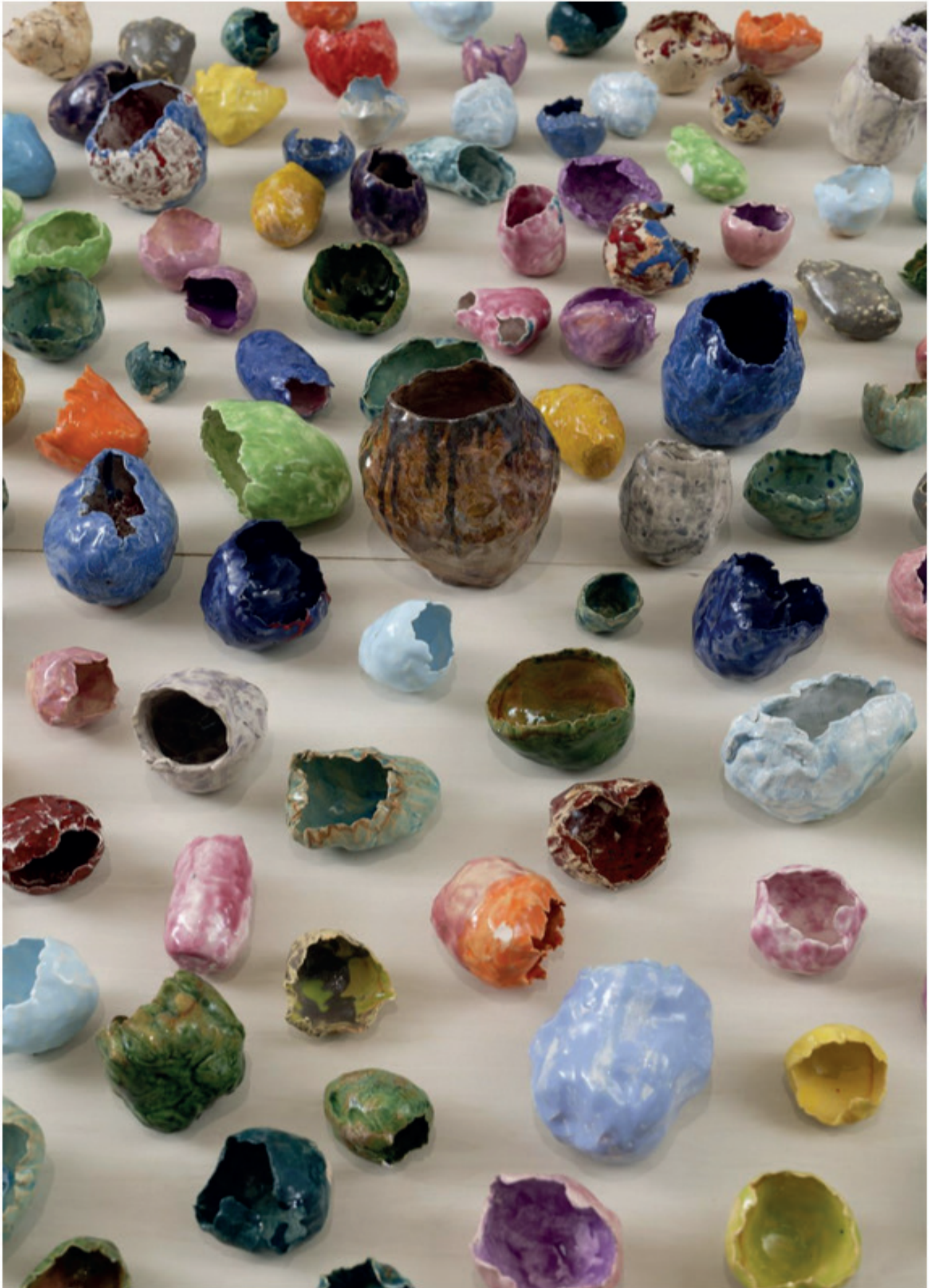
Michele Ciacciofera, Condenser l'Infini , 2024, exhibition view, Passerelle Centre d'art contemporain, Brest ©photo: Aurélien Mole – Courtesy the artist and Michel Rein, Paris / Brussels