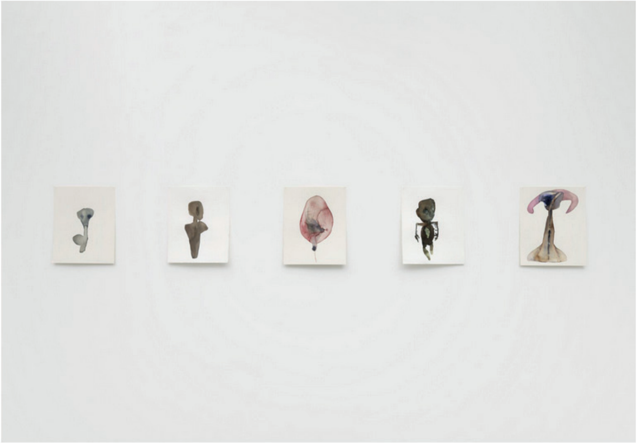
Michele Ciacciofera, Condenser l'Infini , 2024, exhibition view, Passerelle Centre d'art contemporain, Brest