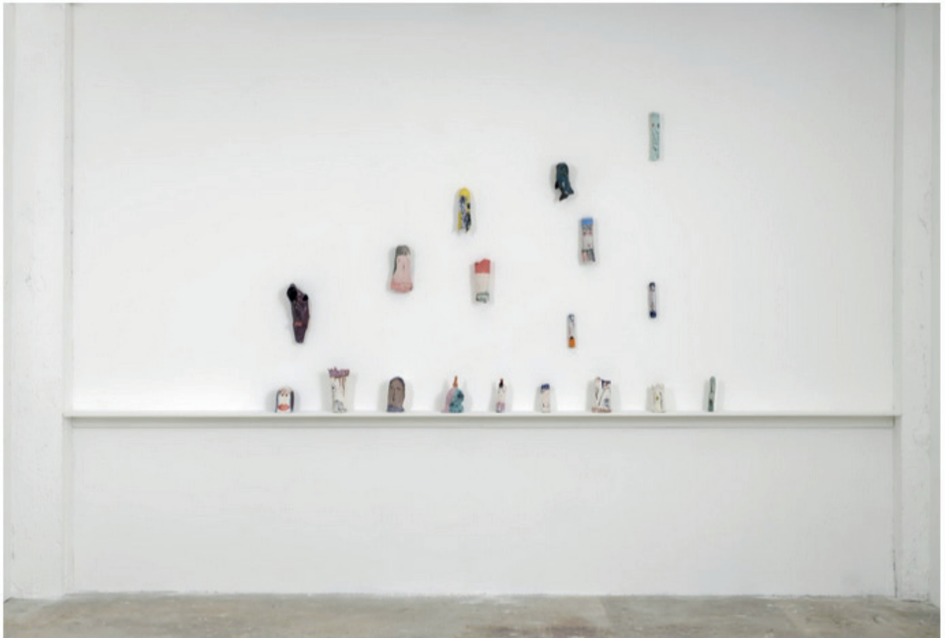
Michele Ciacciofera, Condenser l'Infini , 2024, exhibition view, Passerelle Centre d'art contemporain, Brest