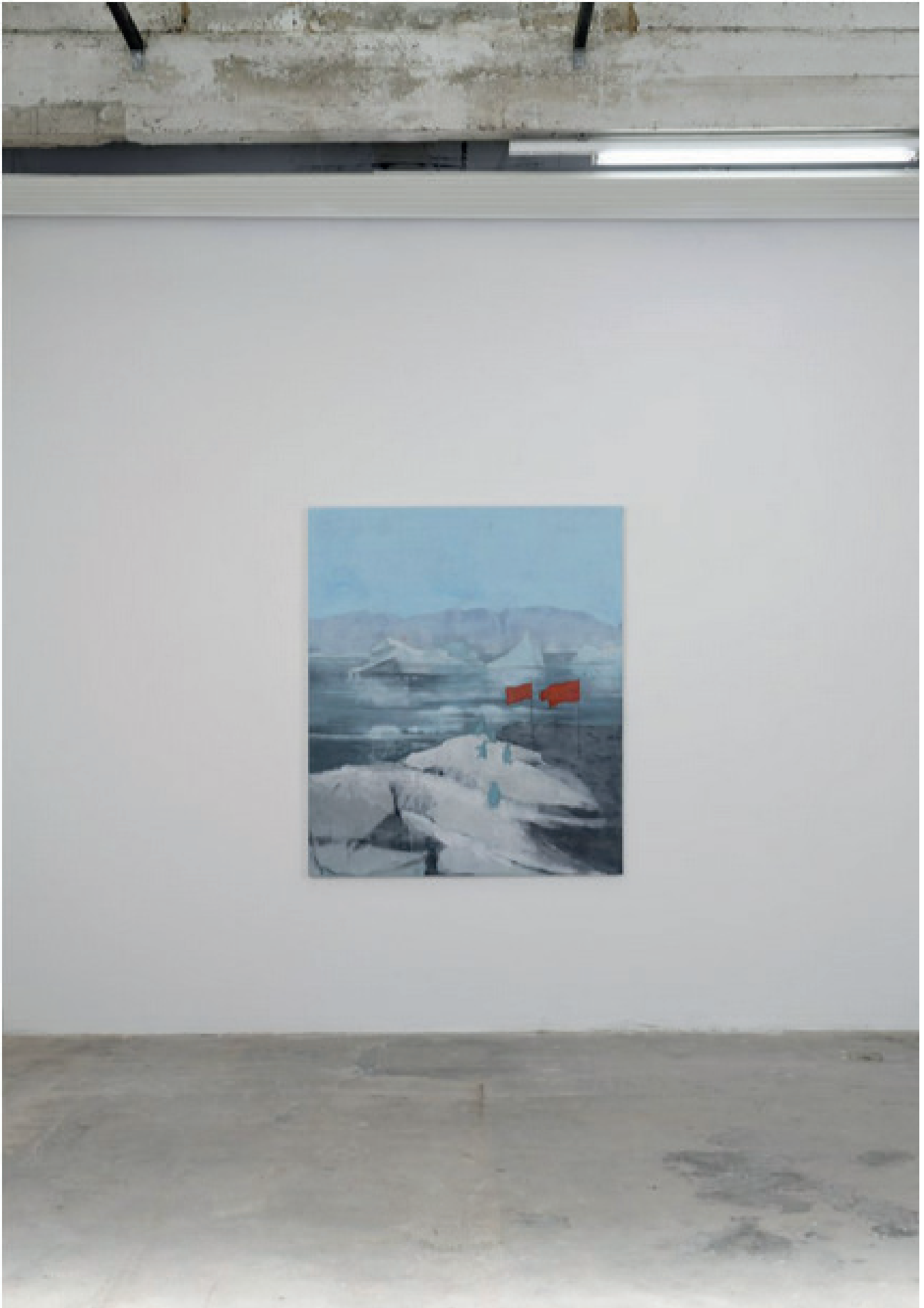
Michele Ciacciofera, Condenser l'Infini , 2024, exhibition view, Passerelle Centre d'art contemporain, Brest