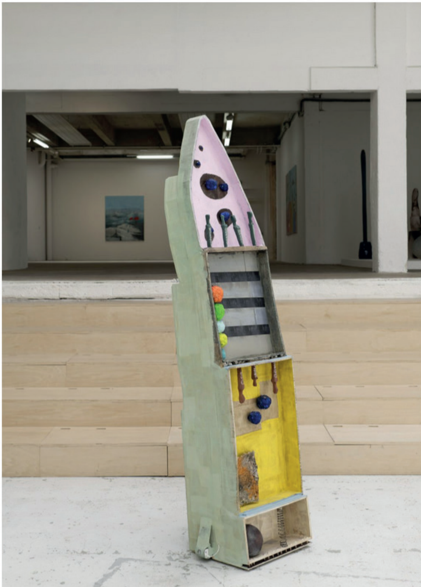
Michele Ciacciofera, Condenser l'Infini , 2024, exhibition view, Passerelle Centre d'art contemporain, Brest ©photo: Aurélien Mole – Courtesy the artist and Michel Rein, Paris / Brussels