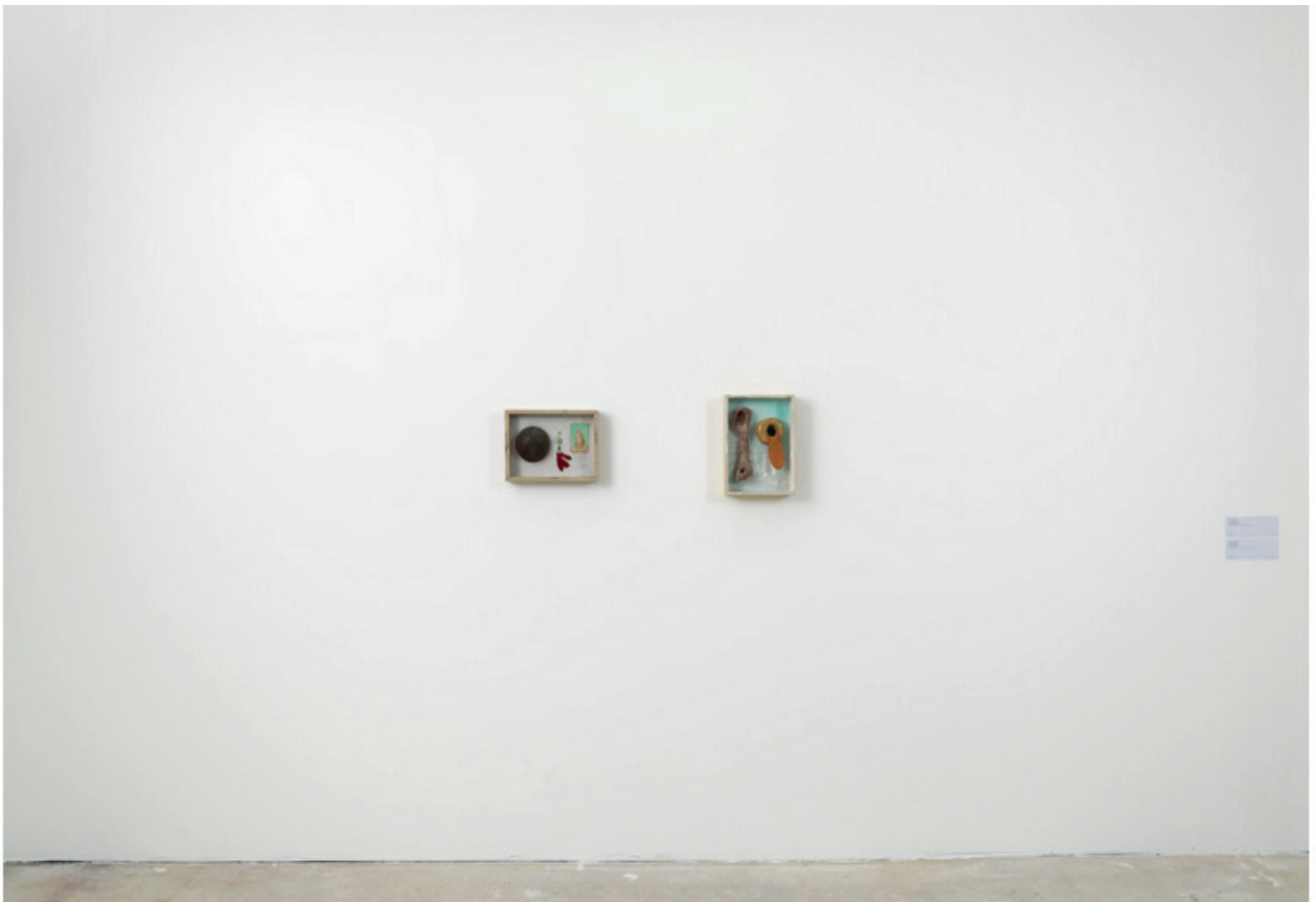
Michele Ciacciofera, Condenser l'Infini , 2024, exhibition view, Passerelle Centre d'art contemporain, Brest