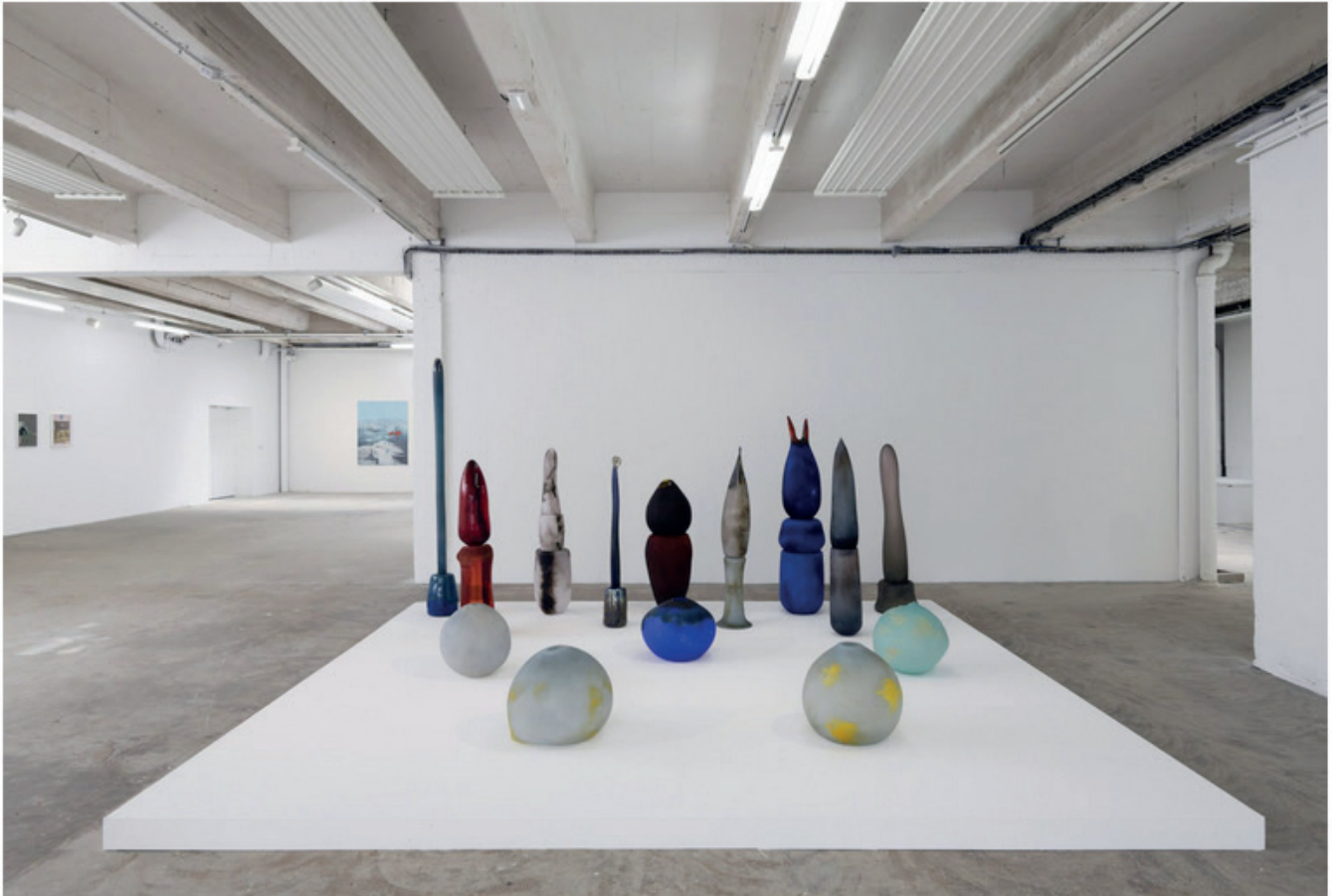
Michele Ciacciofera, Condenser l'Infini , 2024, exhibition view, Passerelle Centre d'art contemporain, Brest