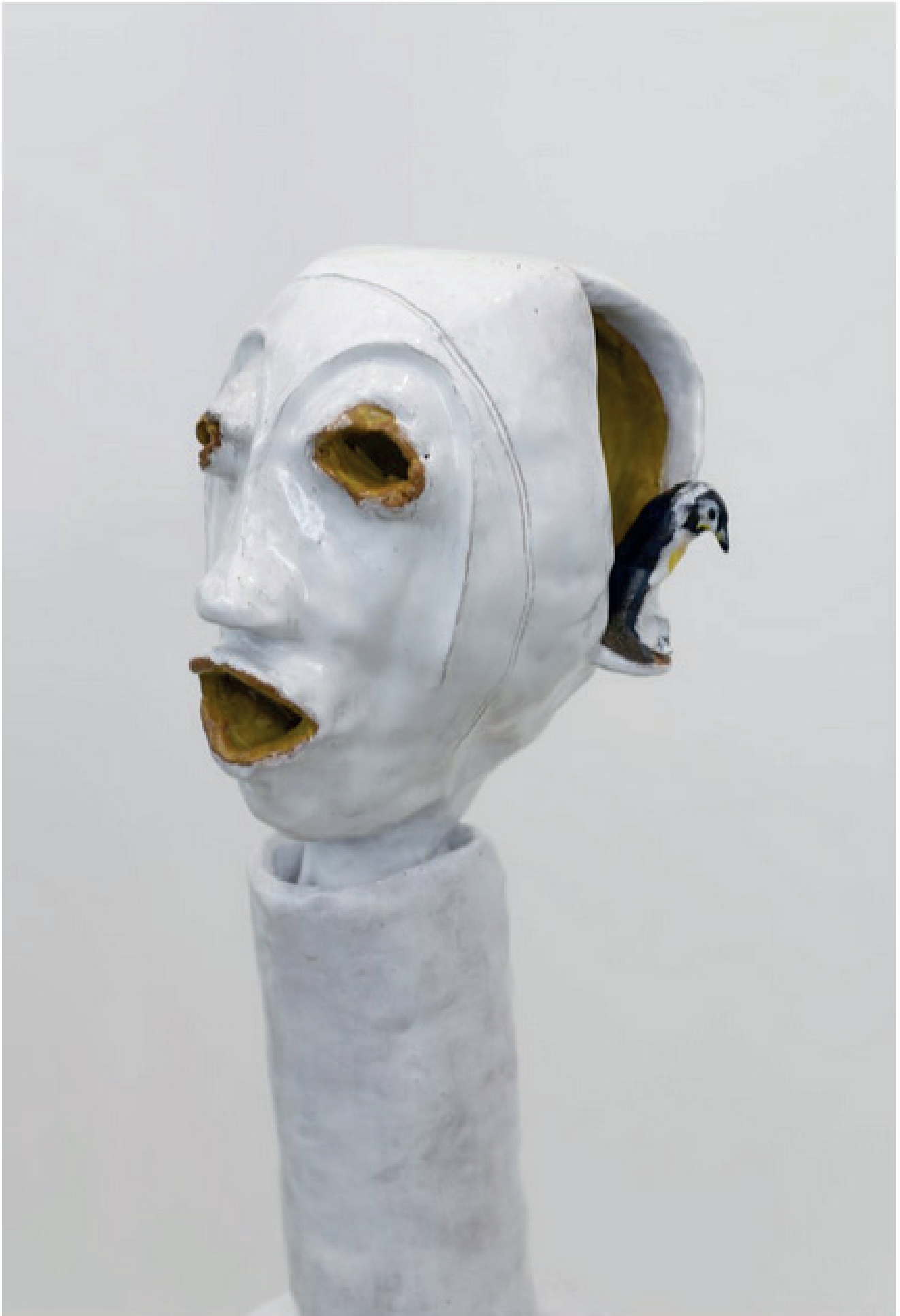
Michele Ciacciofera, Condenser l'Infini , 2024, exhibition view, Passerelle Centre d'art contemporain, Brest