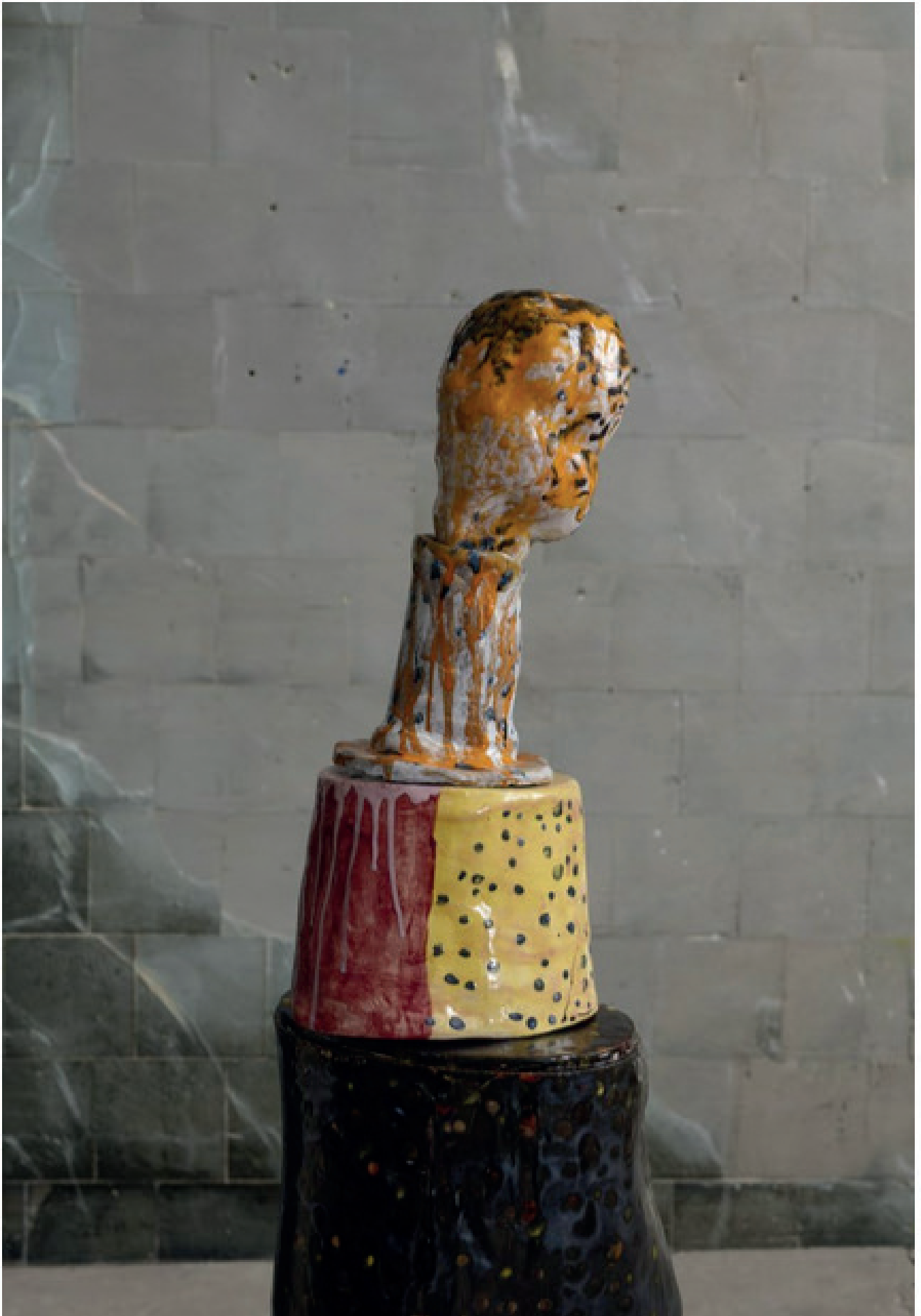
Michele Ciacciofera, Condenser l'Infini , 2024, exhibition view, Passerelle Centre d'art contemporain, Brest