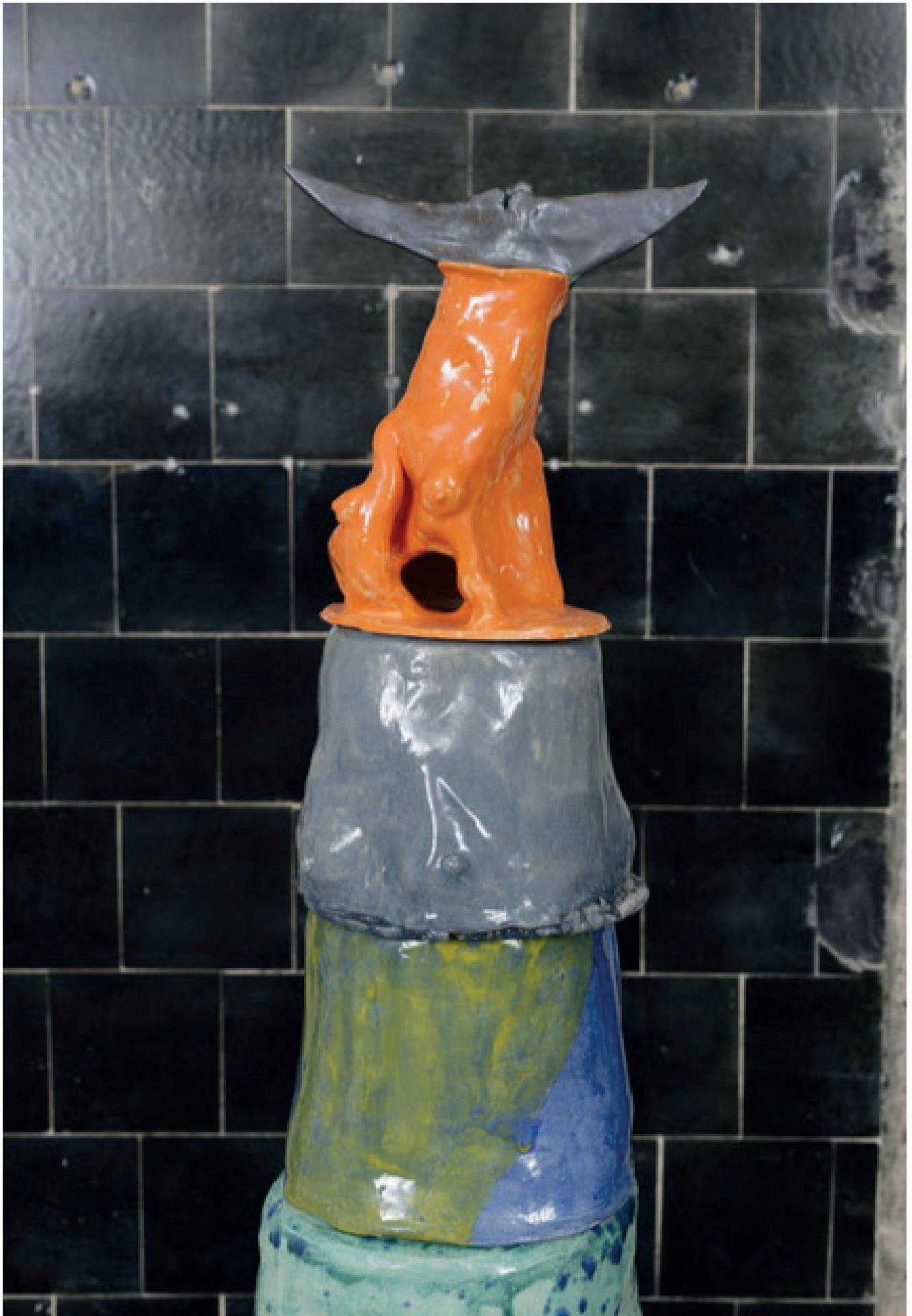
Michele Ciacciofera, Condenser l'Infini , 2024, exhibition view, Passerelle Centre d'art contemporain, Brest