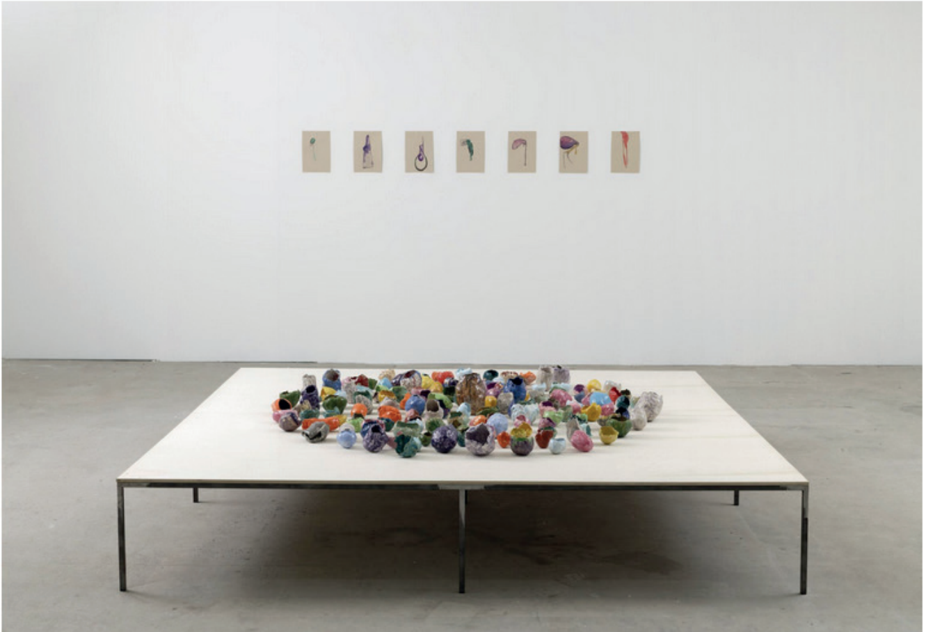
Michele Ciacciofera, Condenser l'Infini , 2024, exhibition view, Passerelle Centre d'art contemporain, Brest