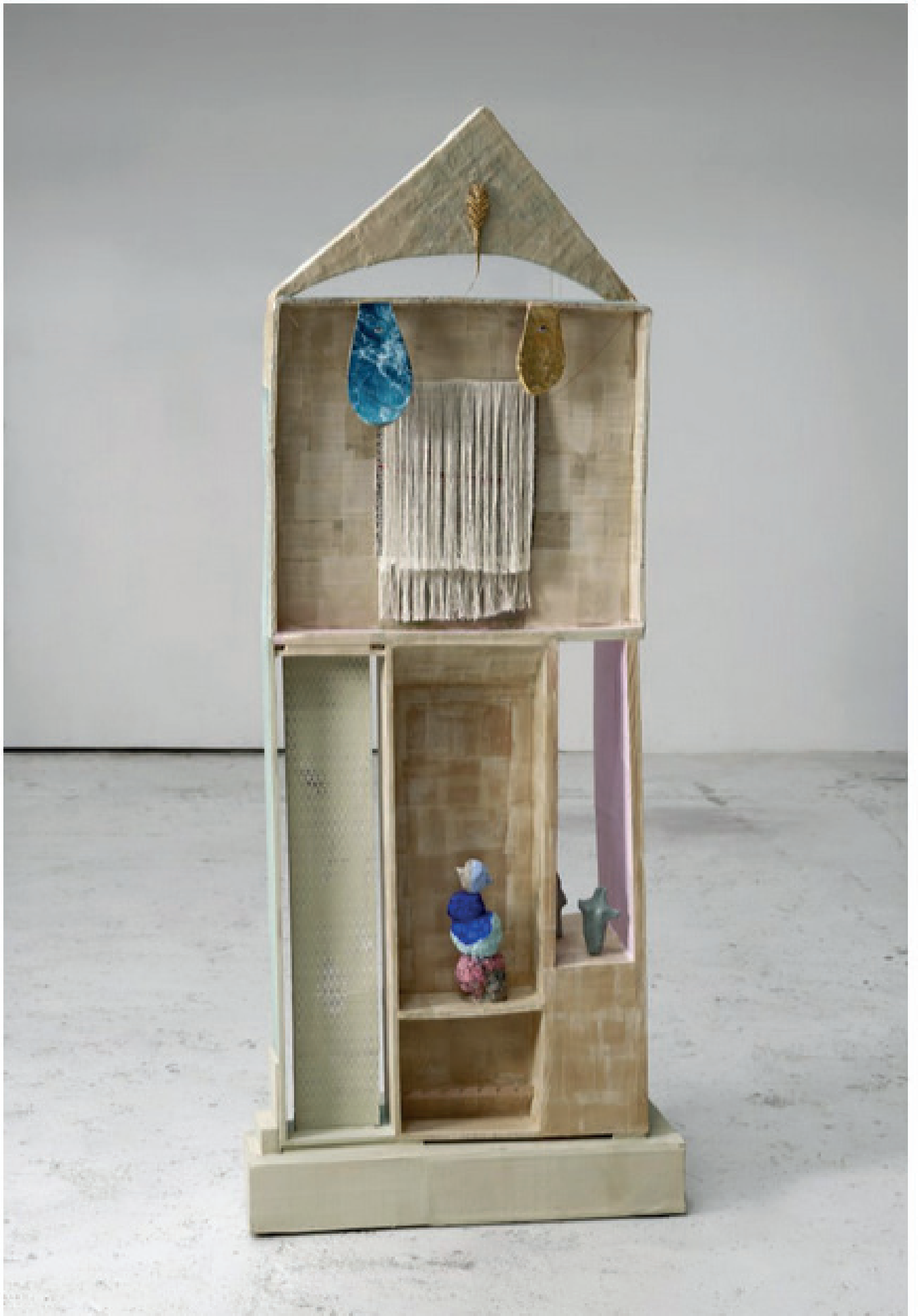
Michele Ciacciofera, Condenser l'Infini , 2024, exhibition view, Passerelle Centre d'art contemporain, Brest