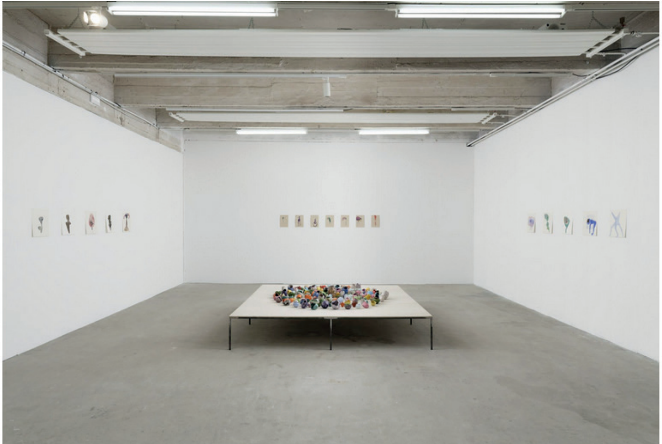
Michele Ciacciofera, Condenser l'Infini , 2024, exhibition view, Passerelle Centre d'art contemporain, Brest ©photo: Aurélien Mole – Courtesy the artist and Michel Rein, Paris / Brussels