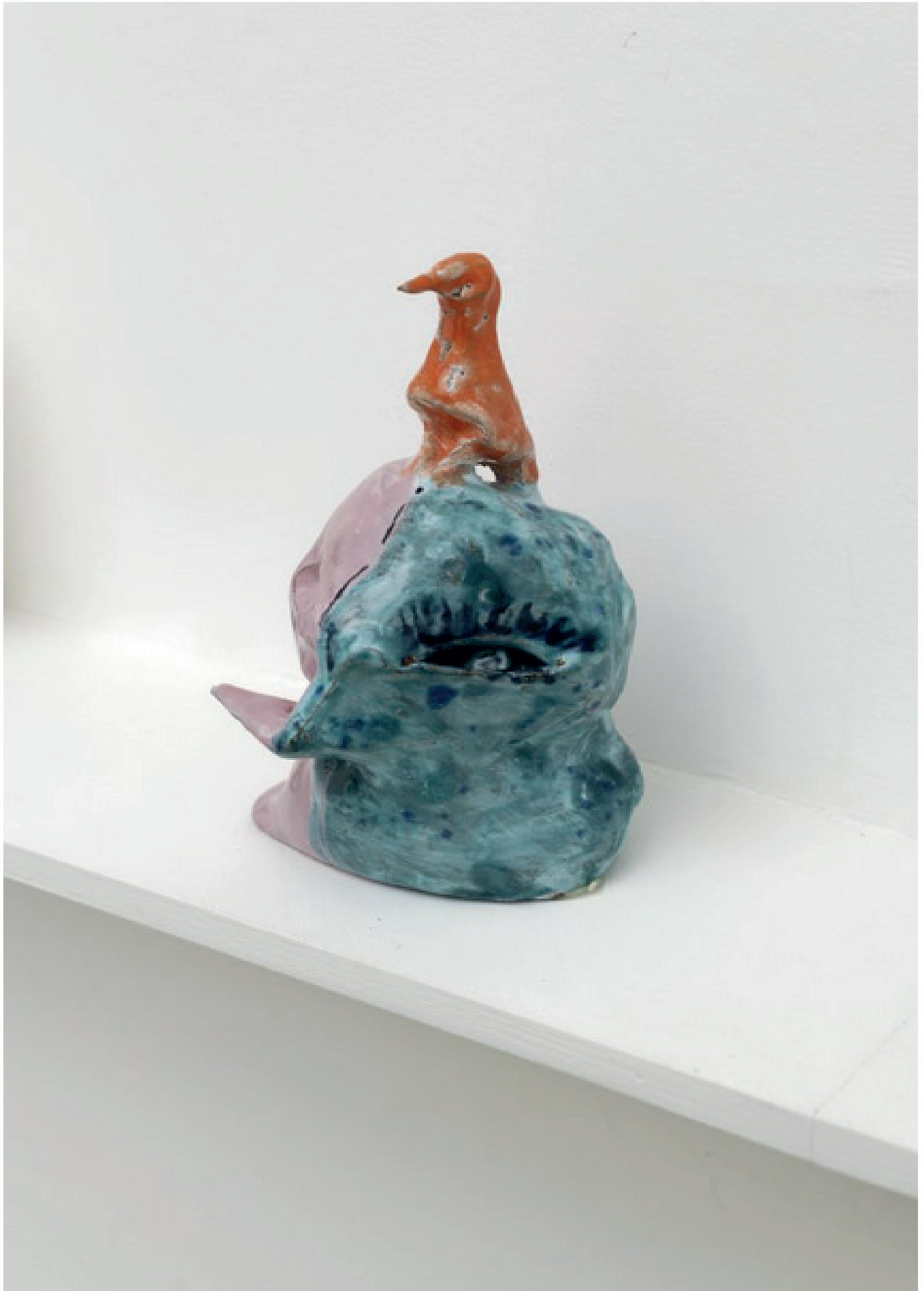
Michele Ciacciofera, Condenser l'Infini, 2024, exhibition view, Passerelle Centre d'art contemporain, Brest