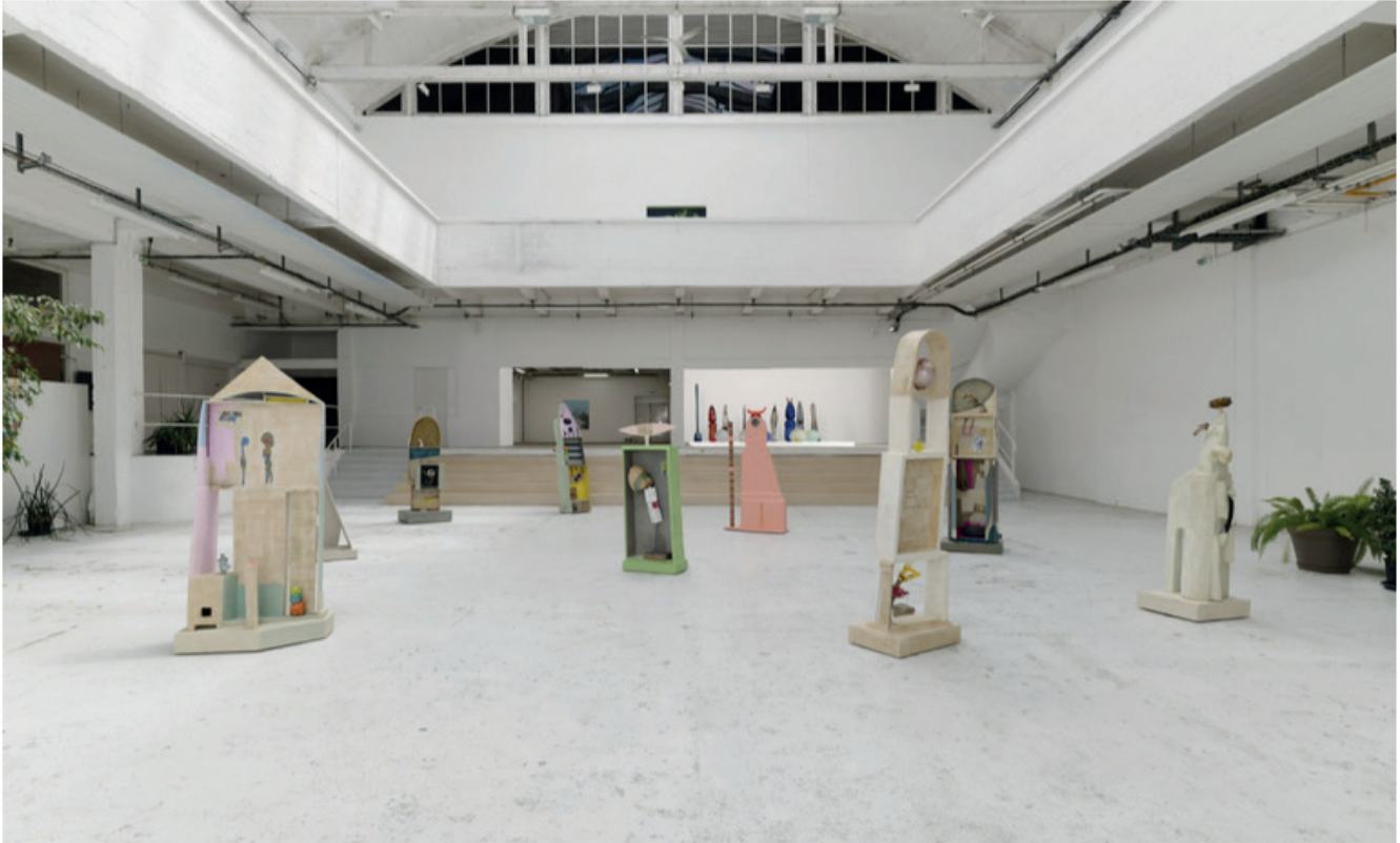
Michele Ciacciofera, Condenser l'Infini , 2024, exhibition view, Passerelle Centre d'art contemporain, Brest

The possibility of condensing the infinite posited by Ciacciofera may lie in this search for an active synthesis of the human history from prehistoric art to the art of today.