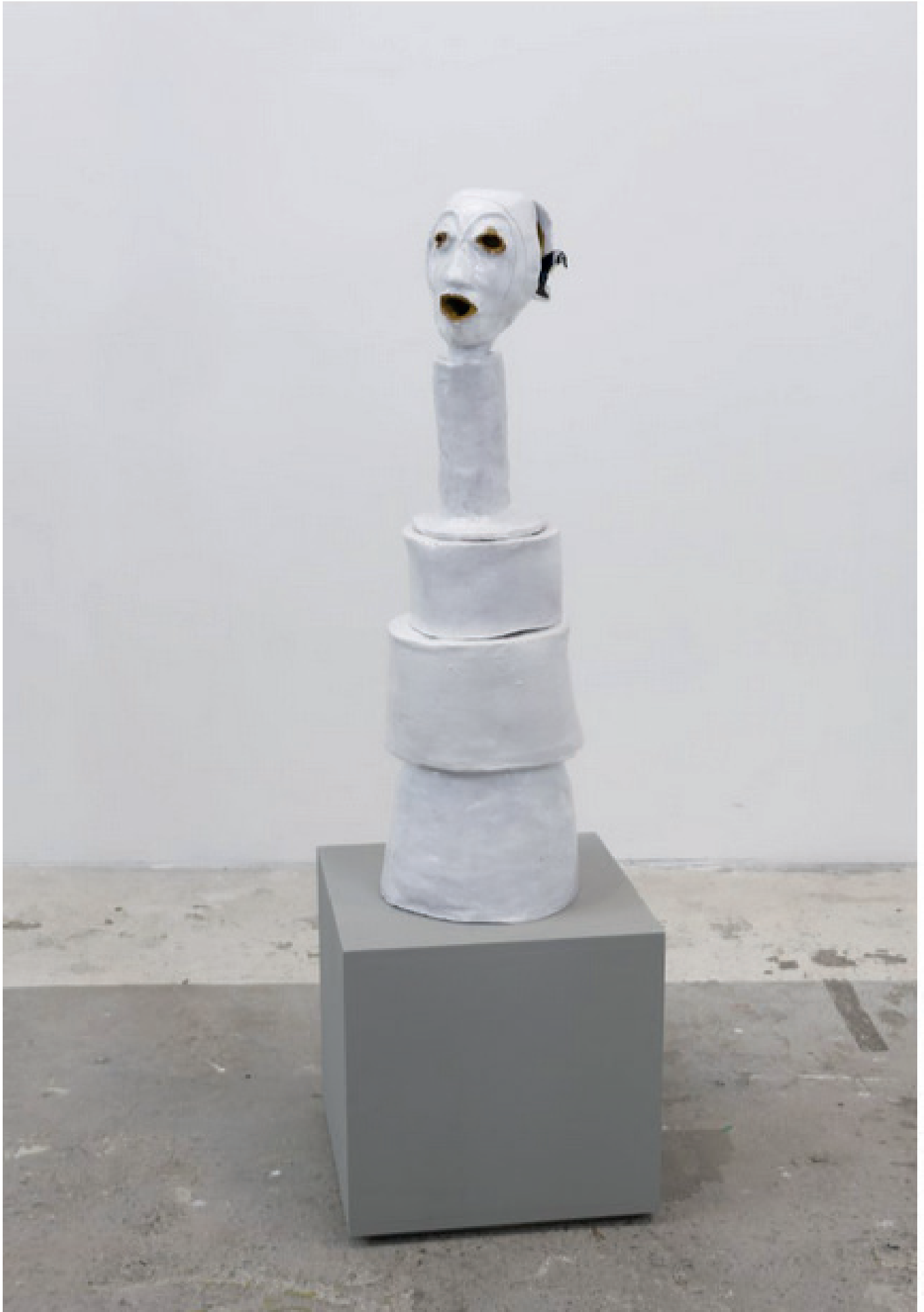
Michele Ciacciofera, Condenser l'Infini , 2024, exhibition view, Passerelle Centre d'art contemporain, Brest