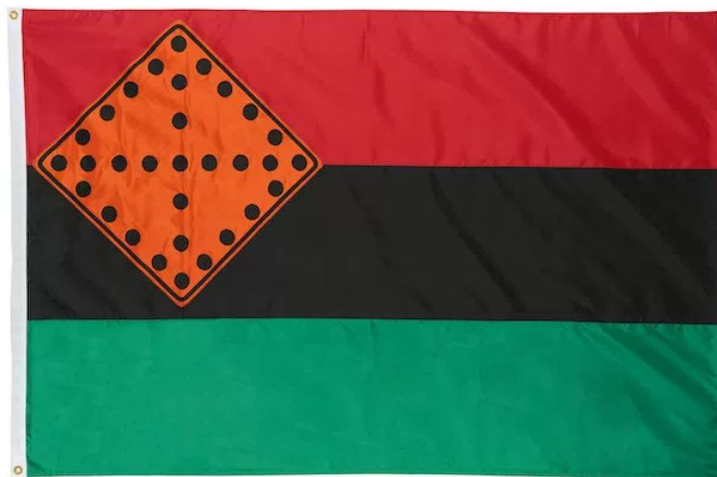
Creative Time: The flag designed by Nari Ward references Marcus Garvey's Universal Negro Improvement Association (UNIA) flag combined with an African prayer symbol known as a Congolese Cosmogram, representing birth, life, death and re-birth. Several of these hole patterns are drilled into the floorboard of one of the oldest African American churches in the United States (The First Baptist Church, Savannah Georgia). It is believed that the pattern functioned as breathing holes for runaway slaves hiding under the floor, awaiting safe transport north. Ward writes, "the union of that moment and of Garvey's black nationalist flag acknowledge the resilience of the human spirit to survive even as we continue the need to remind America that Black Lives Matter."