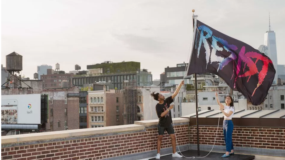
Installation view of "Resist" by Marilyn Minter.

FLAGS HAVE PROVEN to be a powerful medium in contemporary art, from David Hammons's "African American Flag" (1990), which sold at Phillips auction for more than $2 million, to Dread Scott's "A Man Was Lynched by Police Yesterday" (2015) displayed last summer at Jack Shainman Gallery, and Nu Barreto's "Desunited States of Africa" (2010) flag on view last month at the 1:54 Contemporary African Art Fair in Red Hook, Brooklyn.