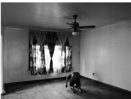
In Grandma Ruby's Valor Bottoms, 2010. From the series Homebody.