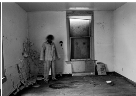
In Gramps' Pajamas, 2010. From the series Homebody.