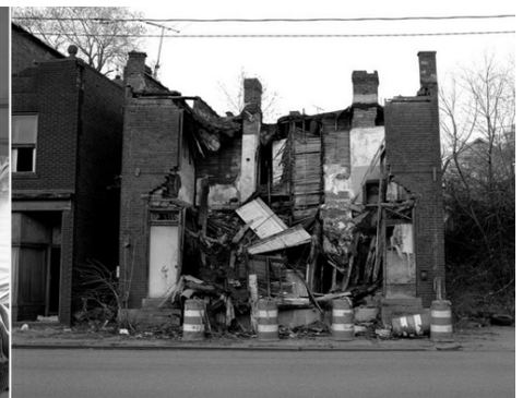
Home On Braddock Ave, 2007. From the series The Notion of Family.