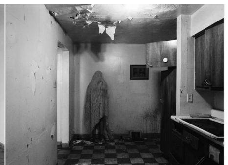
Covered in Gramps' Blanket, 2010. From the series Homebody.