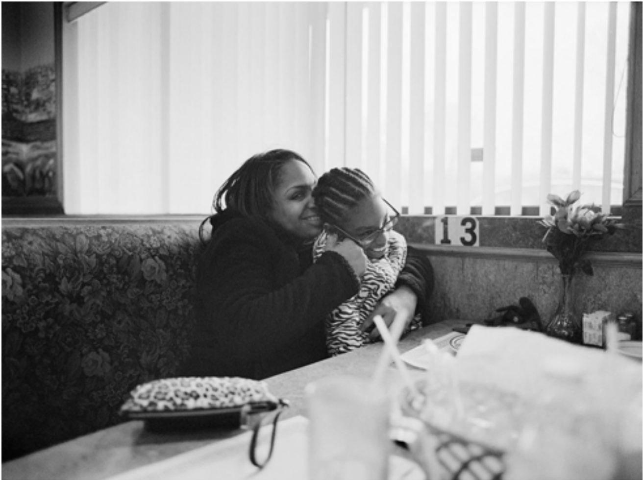
© LATOYA RUBY FRAZIER, FROM THE SERIES "FLINT IS FAMILY," 2016

In April, I ride shotgun as Shea makes her daily trip to the distribution site closest to her house—a parking lot where flatbeds of water bottles are piled each morning. She pulls in and opens her trunk, watching in her rearview mirror as a staffer deposits four cases of filtered spring water in the van. "Faster than a drive-through window," Shea says.