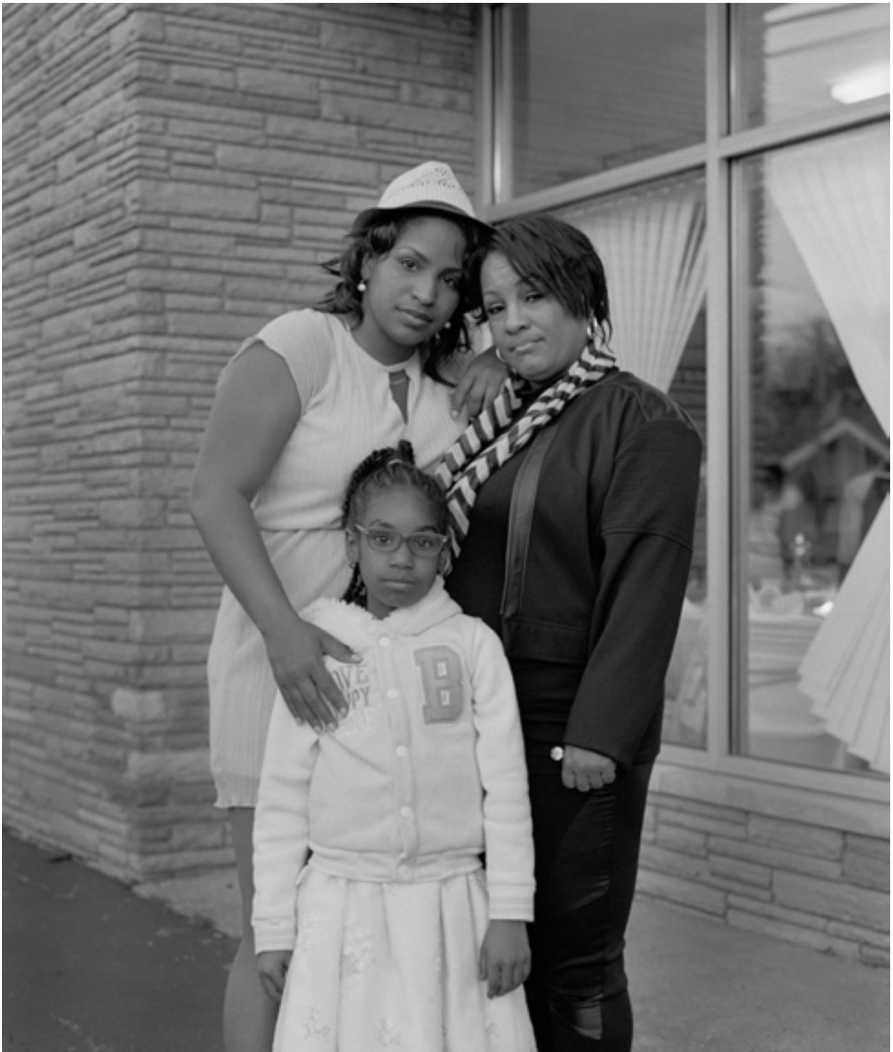
© LATOYA RUBY FRAZIER, FROM THE SERIES "FLINT IS FAMILY," 2016

When I visited these women over this past winter and spring, to learn about how one family endured the water crisis, they stressed that to me. Flint was family. Family was Flint—until now. This is the story of how a town loses a family and a family loses a town.