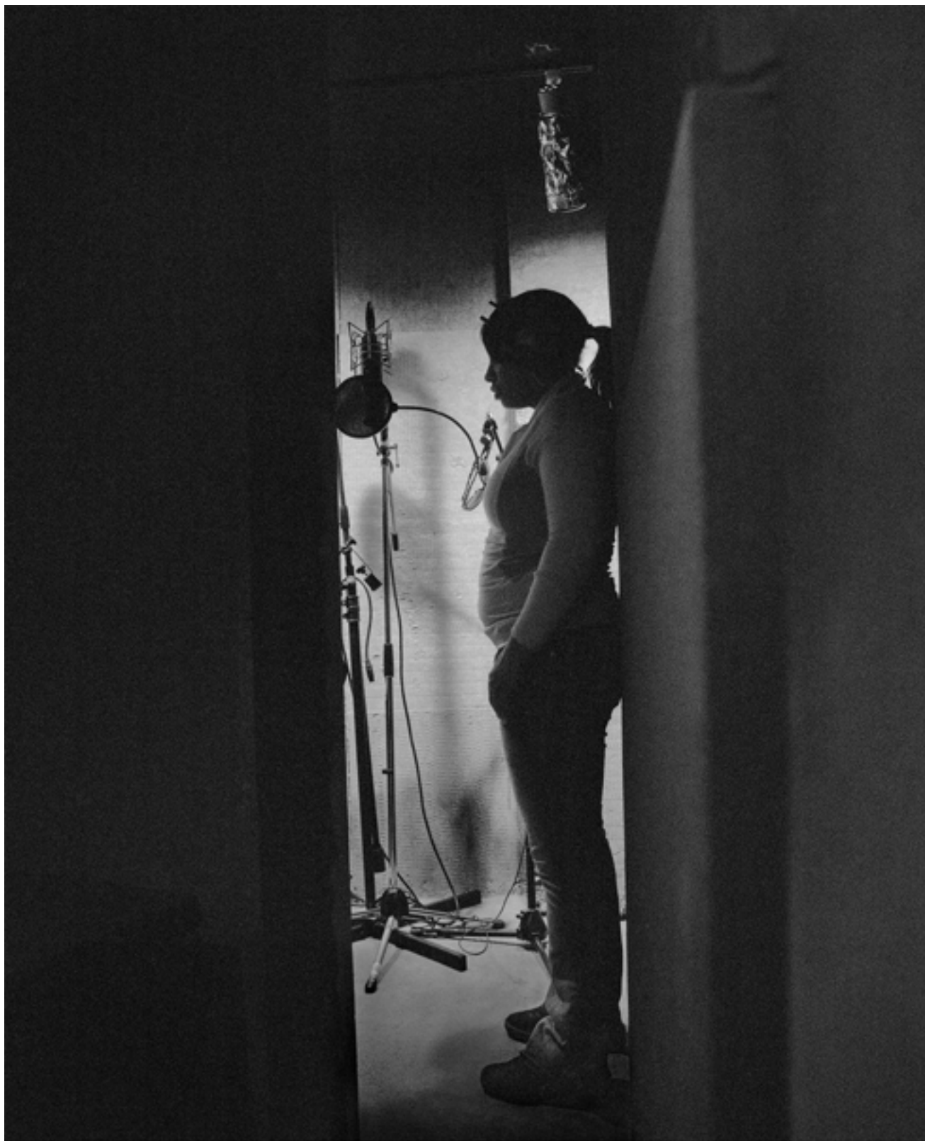
© LATOYA RUBY FRAZIER, FROM THE SERIES "FLINT IS FAMILY," 2016

Too many roads I see don't make it to nowhere/ So Imma spread my wings/ Go by air/ 'Cause it's my destiny to be above it all/ My head high/ I stand tall/ Who's gonna stop me now?/ Is it you?