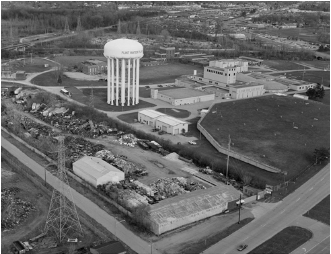
City of Flint water plant and the Industrial Iron & Metal Co.