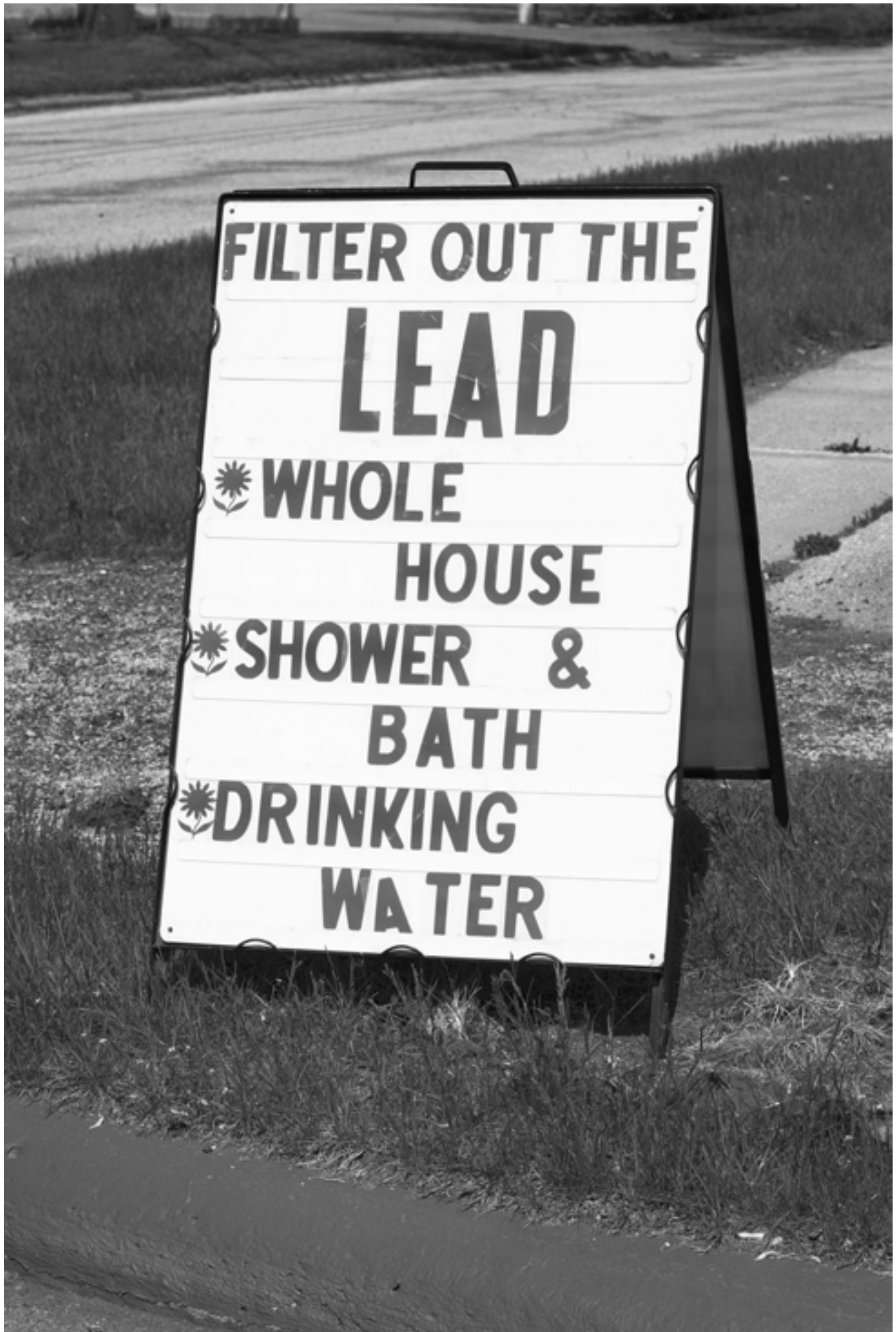
© LATOYA RUBY FRAZIER, FROM THE SERIES "FLINT IS FAMILY," 2016 A sign outside the Grainery Natural Grocery