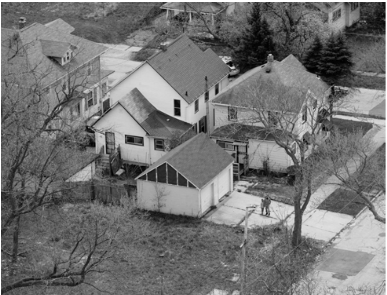
© LATOYA RUBY FRAZIER, FROM THE SERIES "FLINT IS FAMILY," 2016

Since 2005, more than 5,000 homes have been bulldozed in Flint. Where the Cobbs once lived, the houses that remain are ransacked and broken. The blue house on Mary Street is still standing. It is surrounded on three sides by vacant lots.