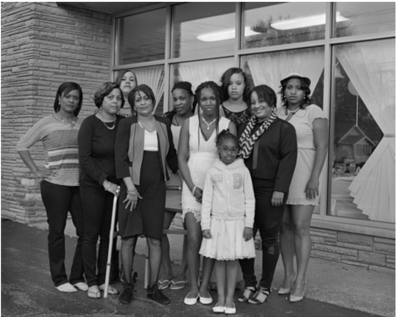
© LATOYA RUBY FRAZIER, FROM THE SERIES "FLINT IS FAMILY," 2016

But less than a decade after the Cobbs moved in, 15.1 percent of people in Flint were out of work—and almost 50 percent of African American teens could not find a job. The oil shocks of the 1970s had derailed the expansion of the auto industry. By the mid-1970s, Japanese carmakers controlled almost 10 percent of the United States market. Henry Ford II described the arrival of Japanese cars on American shores as "an economic Pearl Harbor." In 1999, General Motors shuttered Buick City, the largest industrial complex in Flint. By 2009, only 5,000 people were still on GM's Flint payroll. "Buick is Flint and Flint is Buick," asserted the official historian of the Buick division of General Motors in 1945. At the time, he wanted to celebrate the connection. Now it sounds like a premonition.