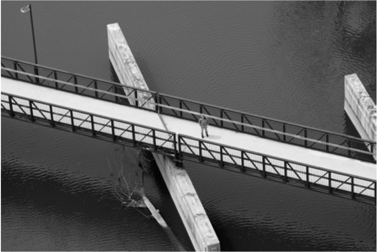
© LATOYA RUBY FRAZIER, FROM THE SERIES "FLINT IS FAMILY," 2016

Flushing and Grand Blanc, which drew water from a different source, officials insisted the water in Flint was fine to drink. "It's a quality, safe product," Mayor Walling said that month. "I think people are wasting their precious money buying bottled water."