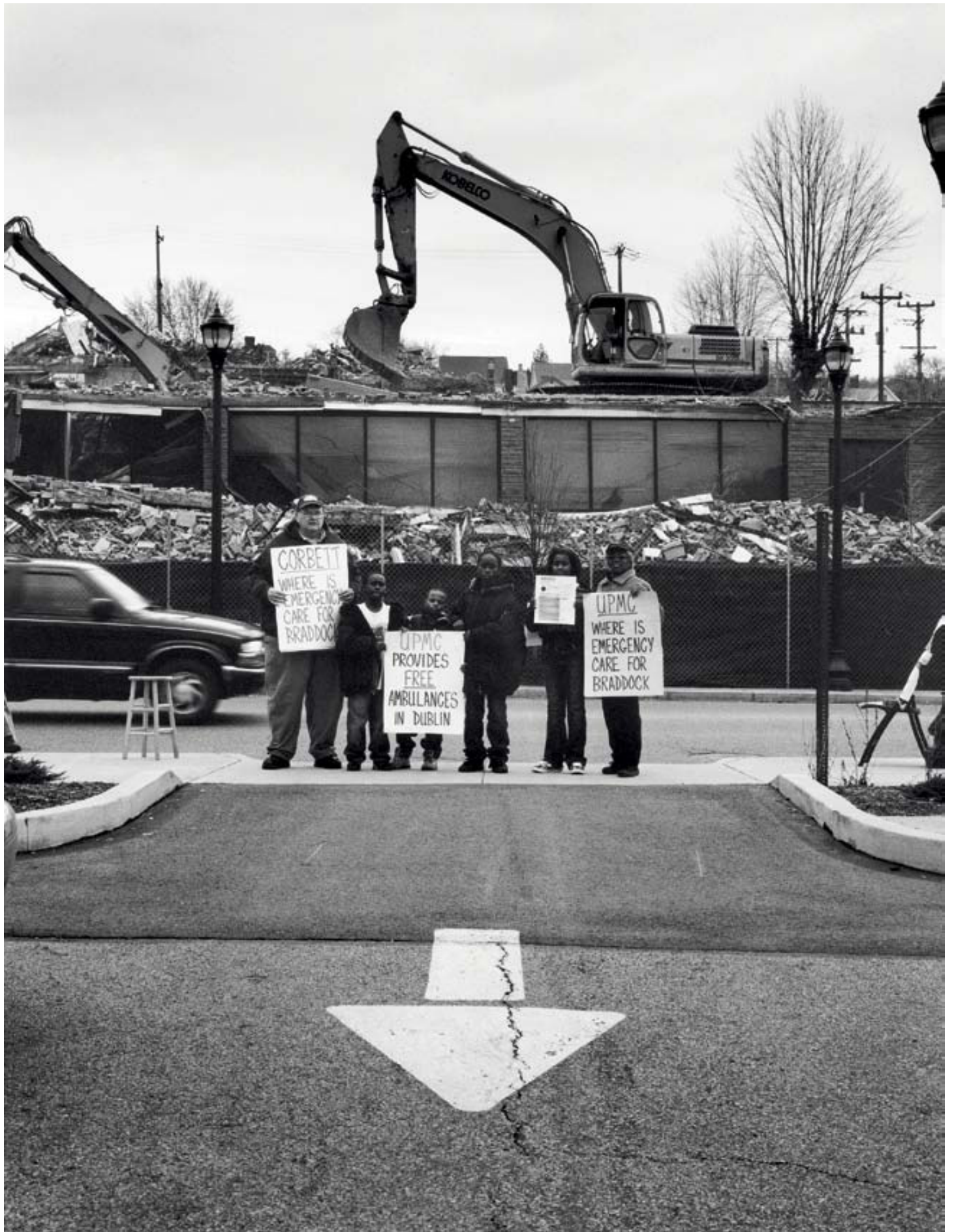
U.P.M.C. Global Corporation, 2011, silver gelatin print mounted on archival museum cardboard, 50 x 40 cm