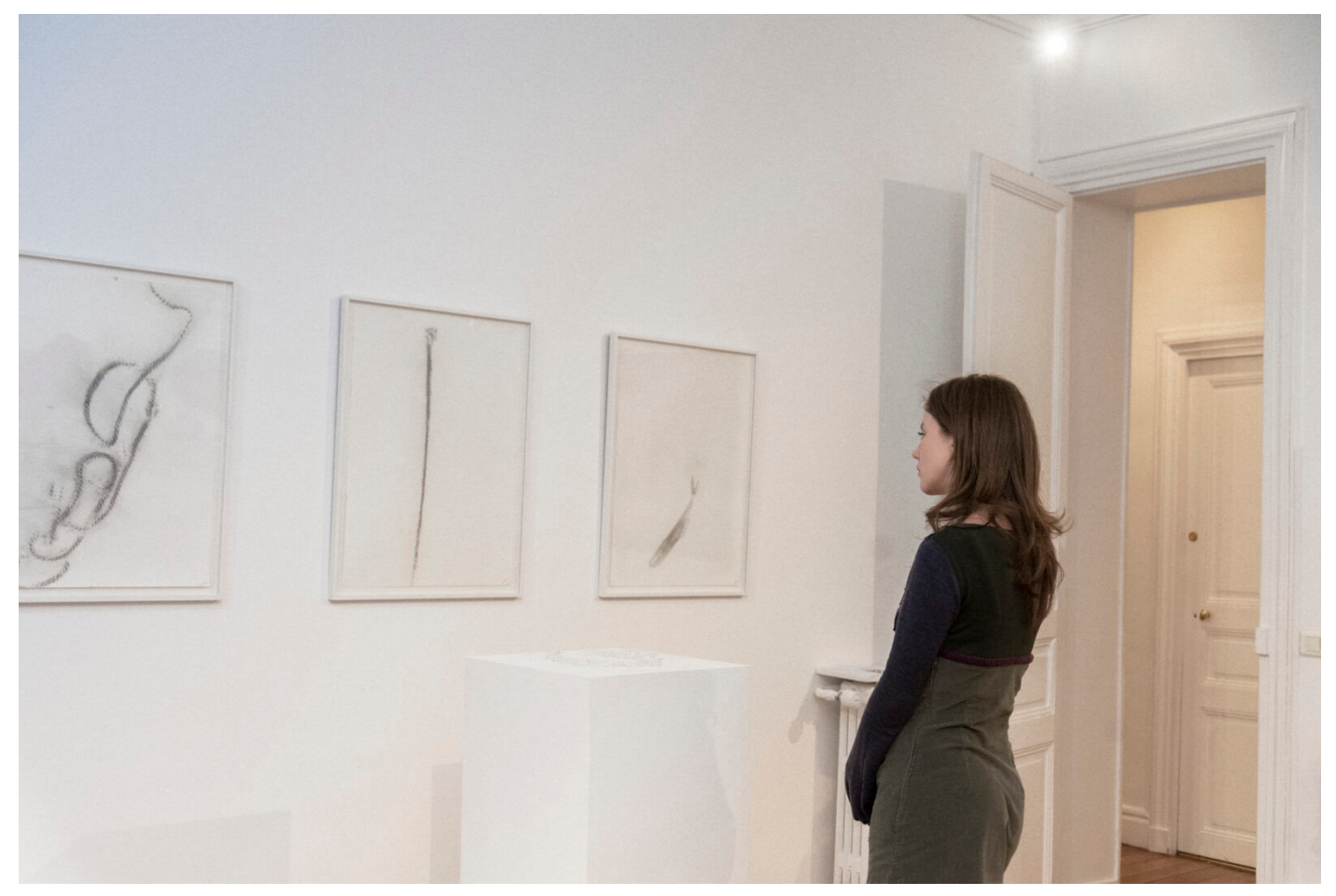
From left to right : JIMMIE DURHAM, Untitled (12) ; (10) ; (04), 2007