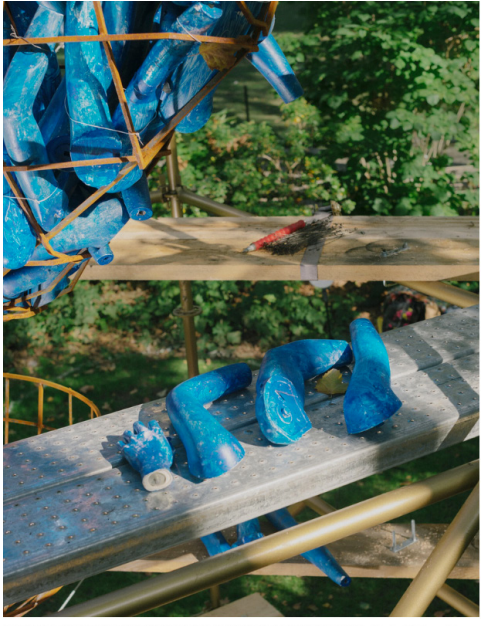
artist often uses mannequins as a generic stand-in for humanity.

In her research for "Light of Freedom," including Ric Burns's 1999 series "New York: A Documentary Film" and a 1977 article in The New York Times, she learned that 11 Angolans were the first Blacks brought to New Amsterdam in 1626 by the Dutch West India Company. After successfully petitioning for their freedom in 1644, some were later granted land to farm just south of the future Madison Square Park, as a buffer between the Dutch settlements downtown and the Native peoples further north.