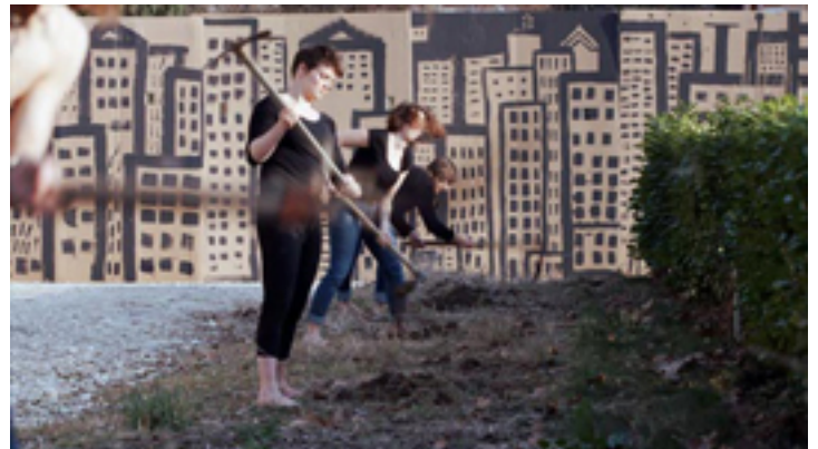
X-Ville , 2015 video 16:9, color, 28' , sound

The challenge was firstly to film images of a big generic city, "How do people live in these big cities?" and secondly the propositions of a utopian city under construction. It was simultaneously a question of the existent and its transformation, meaning providing images of an "achievable utopia" beyond any librarian's anecdote; to do this, the need