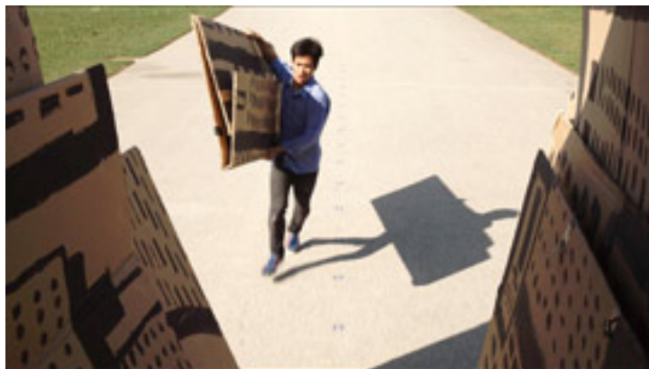
X-Ville , 2015 video, 16 :9, color, 28', sound

Throughout the process, I always took into account, without great effort, Friedman's advice on the importance of improvisation. A first choice was made during the shooting, following the requirements of the film's own construction. Above all, it involved bringing to life some very precise situations, just announced by Friedman's very schematic, almost diagram-like drawings, which found an expansion over time, an extension by movement and by action.