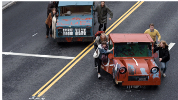
Svartlamon Parade , 2014 video, 16:9, color, 15', sound

to create a world, which showing itself to be pure construction, pure deco, might admit these transformations into its bosom with its own rules and laws, has imposed itself like a logical principal. A great decor which followed no pre-established plan, but which finds its place every time, which creates itself before the camera, which is made with "what we've got", and which allows unexpected actions inside, lost sheep and dogs chasing cockerels. Beyond any representation, and in the way they have contributed to making the film, one should see the animals, men, women and the relationships between them as an allegory of a possible audience, of an X-Ville which has already existed for some time.