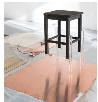
mountincutters, Objet incomplet (ctrl c respiration) , 2022

Graduating from ESADMM (Beaux-Arts de Marseille) in 2014, they mainly practice In-situ sculpture, radically contaminating the space of places. Echoing this disturbance is an aesthetic uncertainty that favours transitory situations and unfinished forms for a priori chance compositions of wild beauty. mountincutters are represented by Meesen De Clercq (Brussels). They have taken part in numerous exhibitions: Palais de Tokyo, Paris, CAB Foundation, Brussels, La Verrière - Fondation Hermès, Brussels, 61ème Salon de Montrouge, Grand Café, Saint-Nazaire, Creux de l'Enfer, Thiers, Fondation Martell, Cognac, Art-O-rama, Marseille, Centre d'Art Neuchâtel, Switzerland.