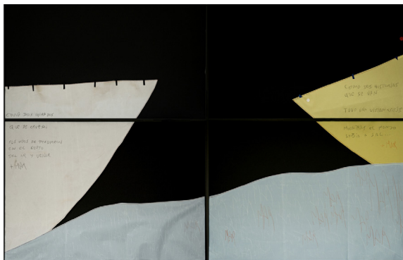
Dos proas, 2024 oil on canvas, hand written text 50 x 60 x 4 cm

His works are part of prestigious collections such as: