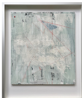
Trouvé sur terre, 2024 oil, wood, sculpted text 60 x 50 x 4 cm

In the cement impressions of sails made by the artist's father, the gesture becomes an imprint. The sail, a symbol of navigation and departure, is fixed in cement like an indelible mark of origin. Here, making is also a form of resistance: to preserve, to honor, to remember. The paintings, with their material and chromatic intensity, function as landscapes in transformation. They do not merely represent a place but embody the sensation of transit, of wandering. Like the sea, they are never static: color accumulates and fades, texture becomes a trace, and the painterly gesture turns into territory.