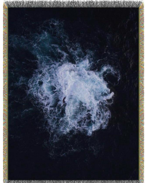
In sea trail, 2024 Jacquard tapissery, unique artwork

These are gestures that shape not only objects but also memories, as if each imperfect form were a fragment of a place left behind, a blurred recollection.