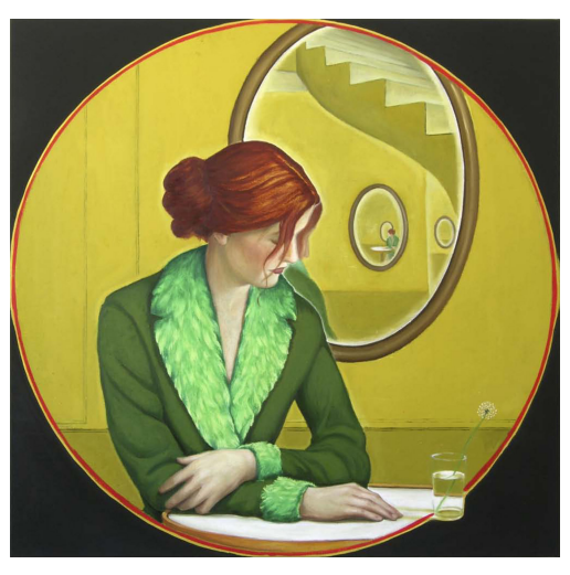
Edgardo Navarro Cycle I, 2014 oil on canvas, 100 x 100 cm

In this open story, where each painting would come to enrich a new episode or a new turn of events, one imagines identifying wise men or magnates who have escaped from a studio in Babelsberg or Billancourt in order to ally with South American dictators or masters of the world hidden behind sunglasses. In the midst of this theatre, the figure in counter relief or subjective camera, a Tintin and Burroughs fuelled hero endeavouring to unveil the secret even if it meant biting into a mushroom and seeing his image disappear in a mirror, or watching, fascinated, as spells are cast on bizarre characters. The precision in the depiction of architectural or clothing details enforces the marvellous character of this swaying from a timeless reality to an unknown destination.