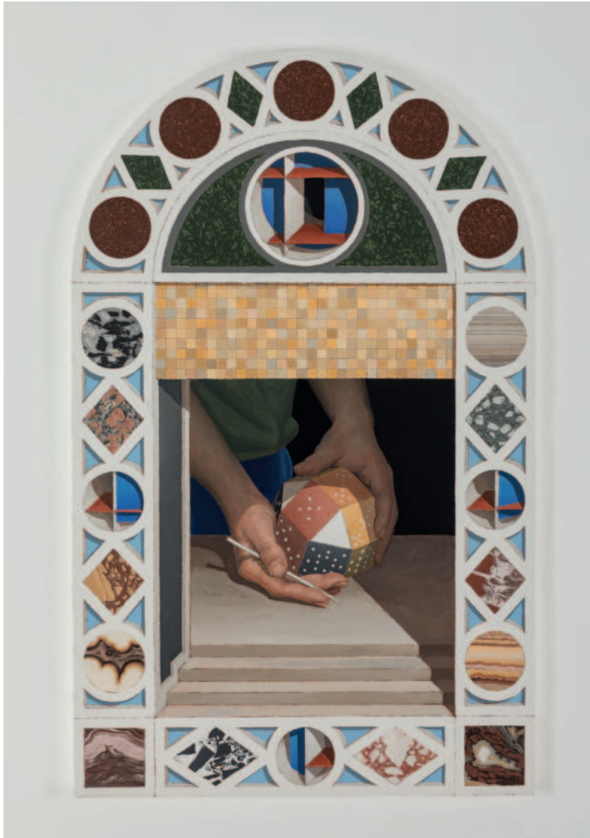
Niche with Magic Rhombi (with RZ & LH), 2024 Oil on wood (MDF) 29.13 x 18.11 in (74,5 x 46,2 cm) HIDA24333