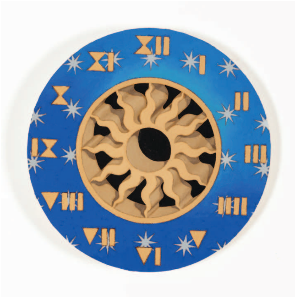
Dark Star, 2024 Oil on wood Diameter 38 cm HIDA24339