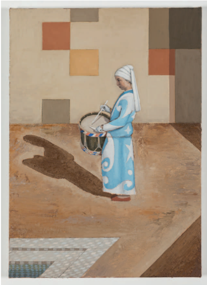
Desert Drummer, 2024