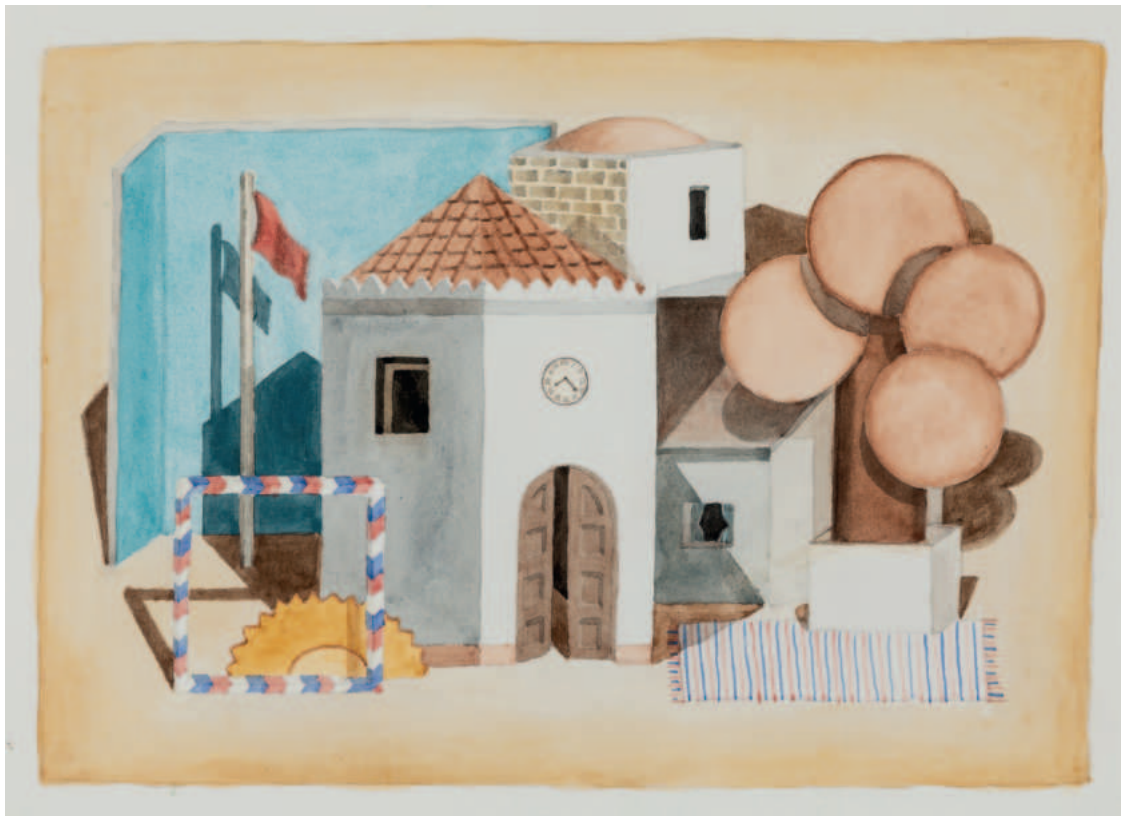
Untitled (Houses 2024), 2024 Watercolor on paper 10.24 x 14.17 in (26,5 x 36,5 cm) HIDA24341