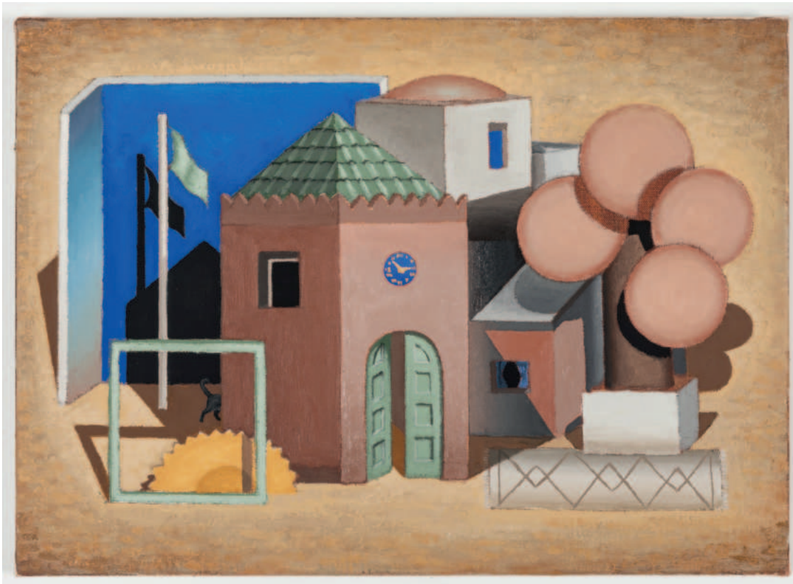
Houses II (reprise), 2024