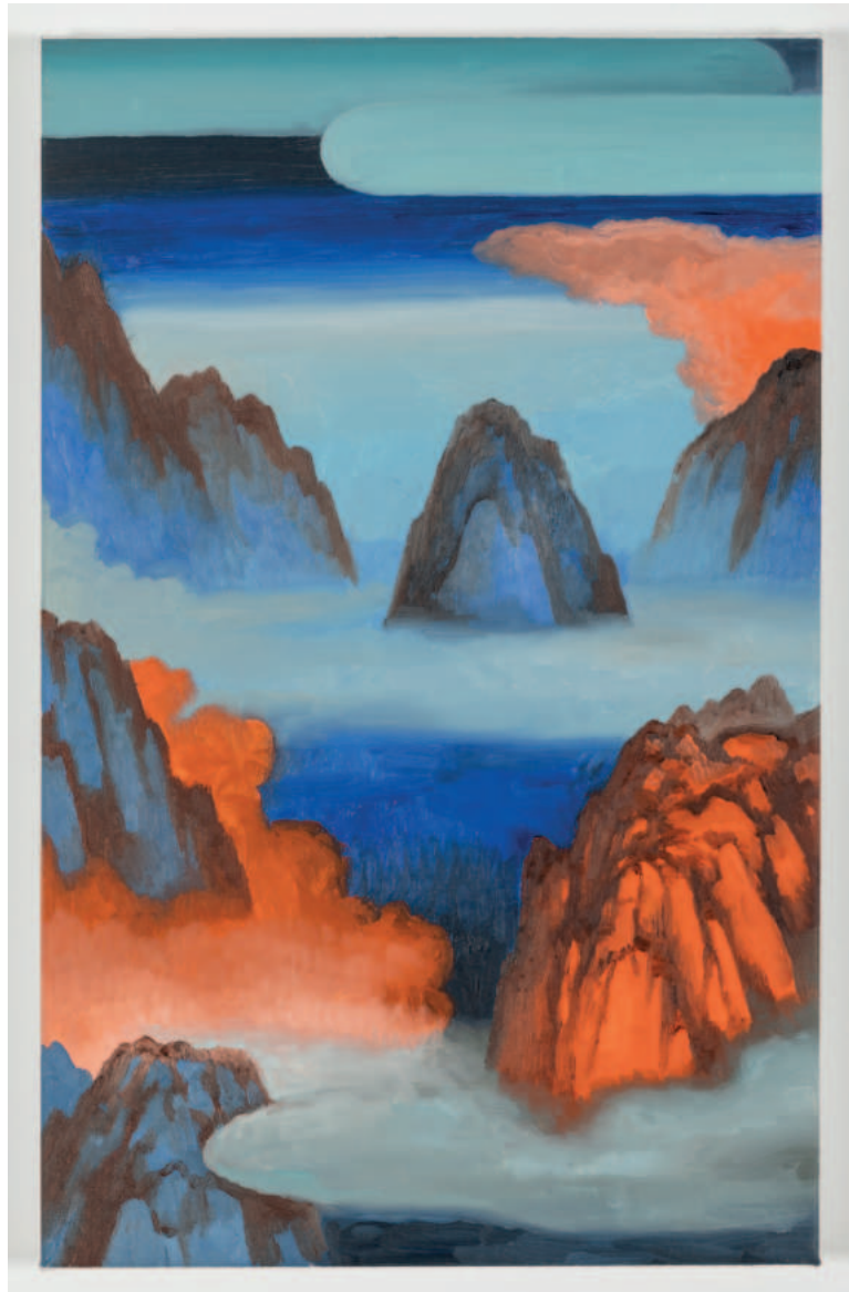
Not titled yet, 2024 Oil on linen 24.8 x 15.75 in (63,5 x 40 cm) HIDA24335