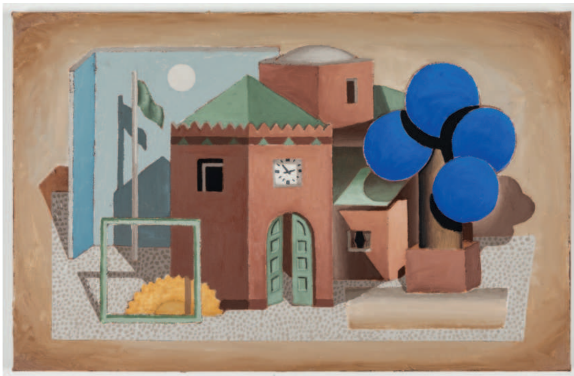
Houses I (reprise), 2024 Oil on linen 14.17 x 22.44 in (36,5 x 57 cm) HIDA24328