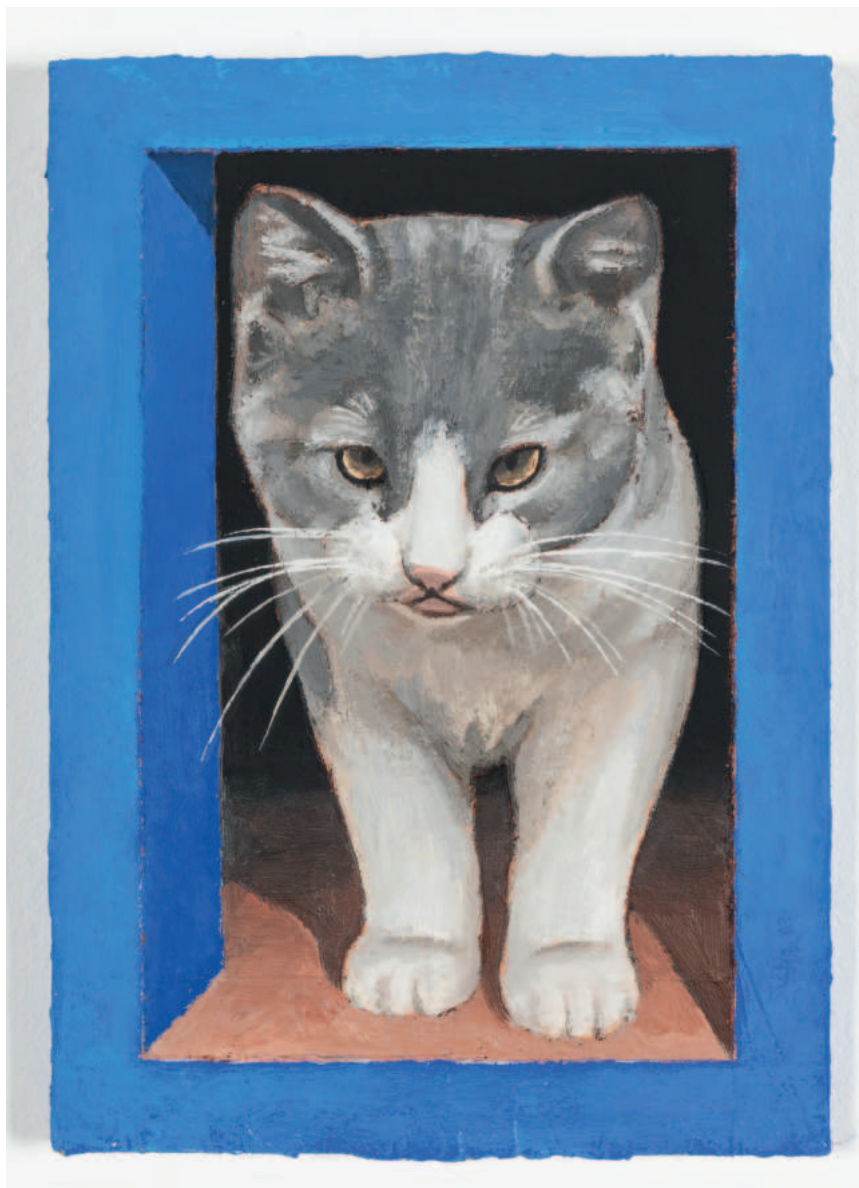
David's cat, 2024 Oil on wood (MDF) 9.06 x 6.3 in (23,8 x 16,8 cm) HIDA24336