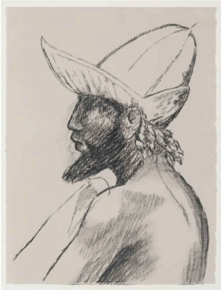
Untitled, 2024 Charcoal on paper 38 x 28.5 cm HIDA24344