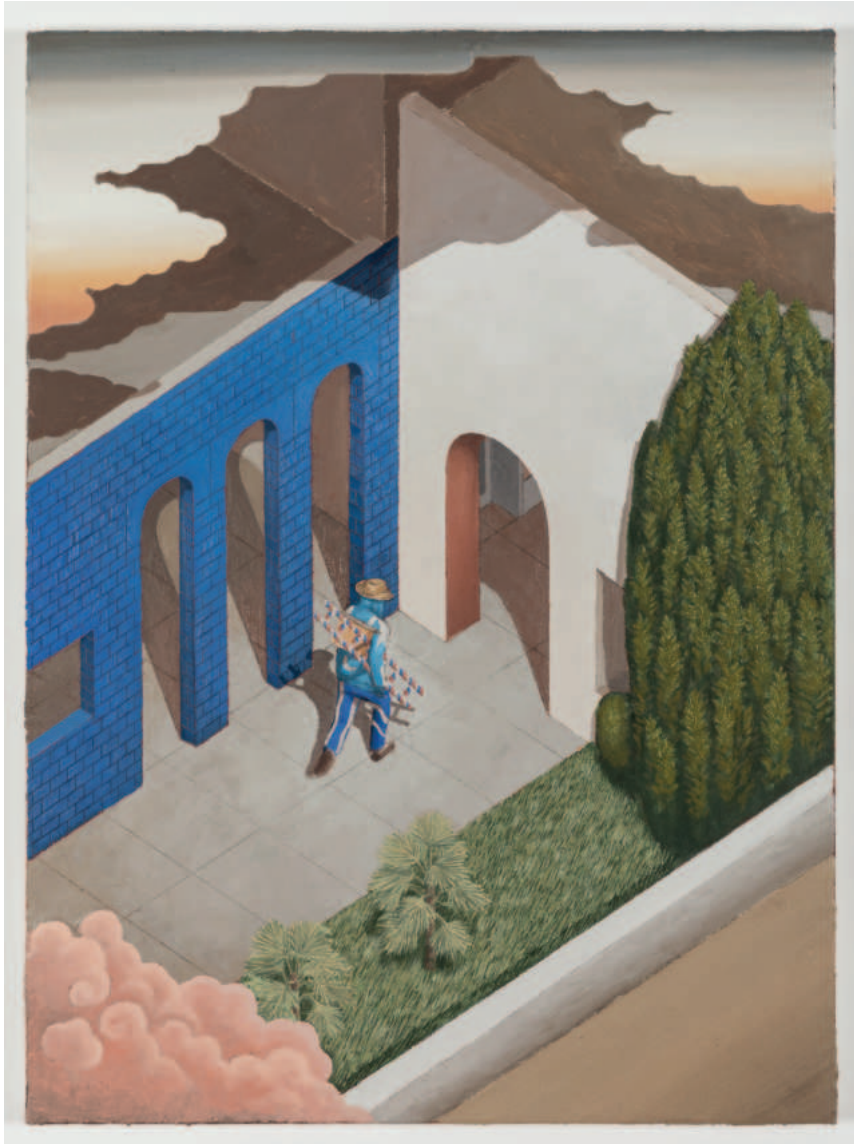
Godo, 2024 Oil on linen 31.89 x 23.62 in (81 x 60 cm) HIDA24327