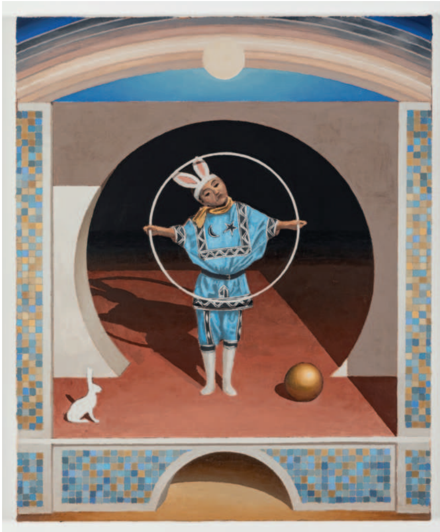
Rabbit Acrobat, 2024 Oil on linen 28.74 x 23.62 in (73 x 60 cm) HIDA24331