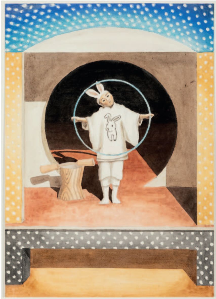
Untitled (Rabbit Boy), 2024 Watercolor on paper 19.69 x 13.78 in (50 x 35,5 cm) HIDA24343