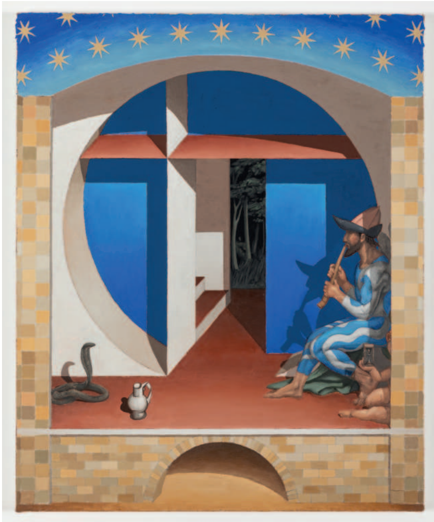
The Snake Charmer, 2024 Oil on linen 28.74 x 23.62 in (73 x 60 cm) HIDA24340