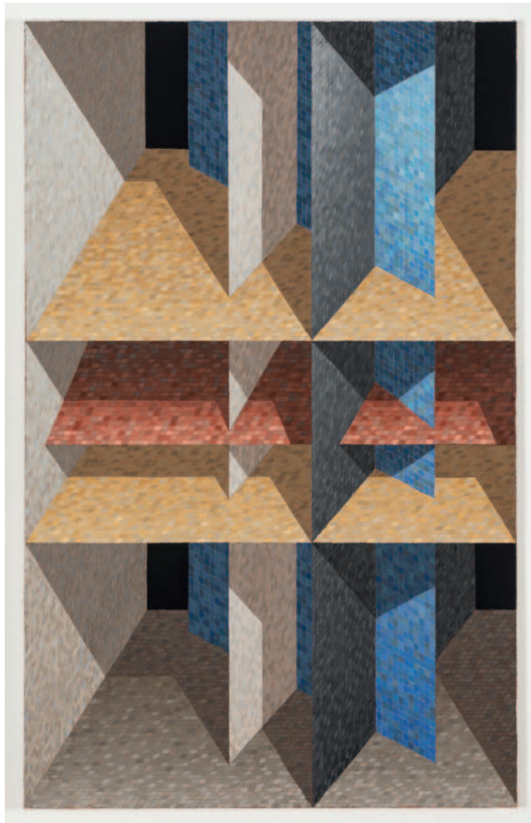
Kirby Mosaic Variation, 2024 Oil on linen 45.67 x 28.74 in (116,5 x 73 cm) HIDA24330