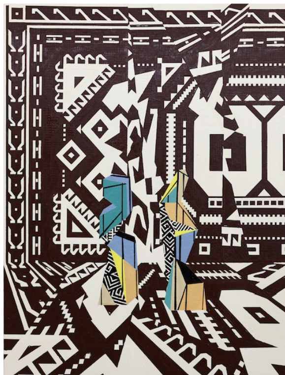
Farah Atassi, Sculptures for Painting , 2014