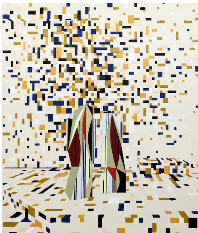
Farah Atassi, The Cloud , 2014