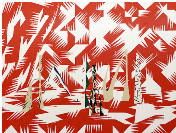
Farah Atassi, Cut-Outs , 2014