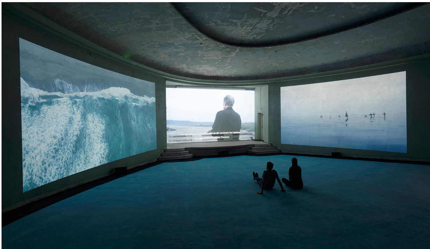
Los durmientes, Palais de Tokyo, Paris, France, 2014. Coll: FRAC PACA, Marseilles, France; Engel collection, Santiago, Chili